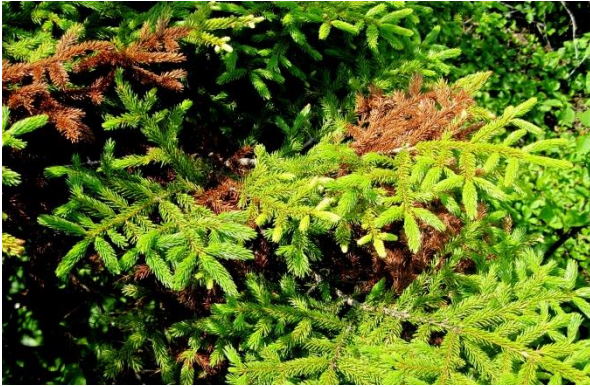
Freezing injury to red spruce foliage, Johnson Mountain Township, Maine.

change investigations. The damage, which includes the death and (usual) reddening of foliage, is the result of either a rapid freezing, or an especially deep freezing of the tissues. This is not the same damage that results from the more common wind-burn, or winter desiccation, and accounts for the significant difference in the pattern of damage on individual trees. The examined trees were of sapling size developing in even-aged stands with no overstory. Damage was considered moderate to light on most individual trees that had been affected, and is not considered to be a serious threat to tree survival.