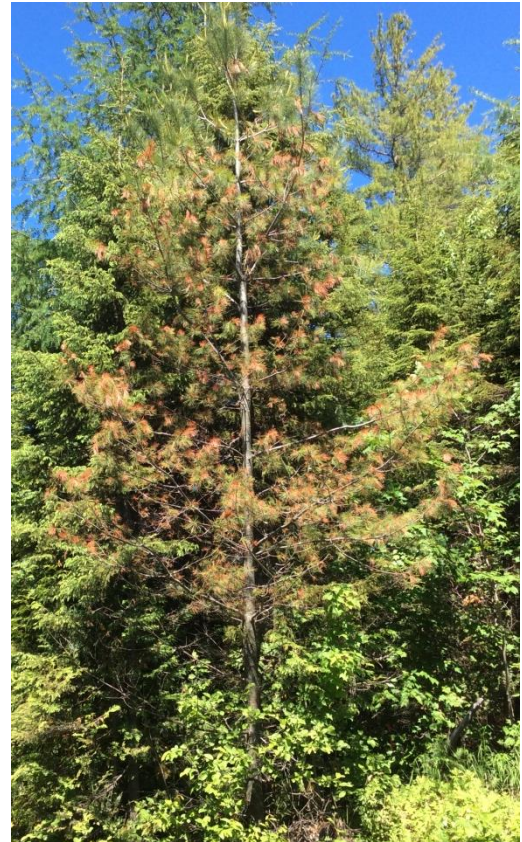
Severe pine leaf adelgid damage on white pine in northwest Piscataquis County.

Pine Leaf Adelgid ( Pineus pinifoliae ) – Pine leaf adelgid is a native insect that requires both spruce and white pine to complete its life cycle. Damage to spruce is mostly aesthetic; damage to pine can lead to significant growth reduction and mortality. There was a region-wide outbreak of this insect between 1953 and 1963 which led to some white pine mortality in Maine. Currently, white pine in parts of Maine are experiencing outbreak populations of this pest. The most severe damage appears to be west of Baxter State Park, with damaged overstory and understory white pine noted in aerial survey, and dead and severely damaged sapling and pole-sized white pine observed in road-side surveys. During the previous outbreak, significant work was done on this pest which may be helpful to current managers. Some of this work is summarized in Maine Agricultural & Forest Experiment Station Publications B658 and TB068 available at this website: http://umaine.edu/mafes-publications/home/forestry-pubs/ .