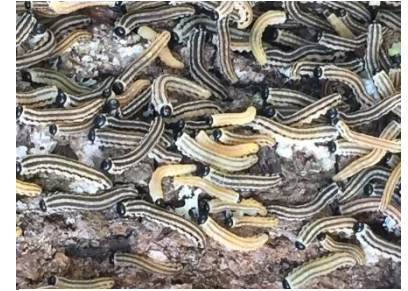
A mass of wandering European pine sawfly.

http://www.extension.umn.edu/garden/insects/find/sawflies/ .