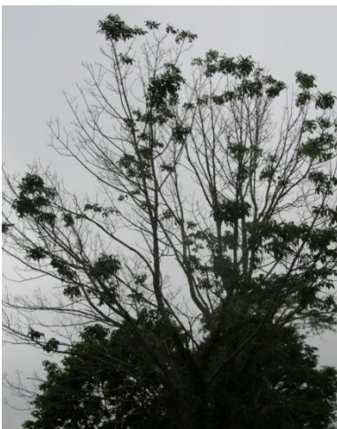
White ash tree heavily defoliated from ash leaf rust, Thomaston, Maine.

Ash Leaf and Twig Rust ( Puccinia sparganioides ) – Ash leaf rust, which can affect all species of native ash in Maine, was reported causing some moderate defoliation in Phippsburg, Maine (Sagadahoc County). It is likely to be found elsewhere along the mid and south-coastal regions, and may become more noticeable over the next several weeks. Look for bright yellow to orange spotting on the leaves and new green twigs. Cupping, twisting, and other deformations of the affected leaves and twigs will also be evident, and canker lesions may become evident. Extensive infections cause brown foliage and early leaf loss. Generally, ash leaf rust does not seriously threaten tree health. However, heavy infections can develop in some years, and severe defoliation over two or three successive years can result in crown dieback, tree decline, and occasionally in tree mortality.