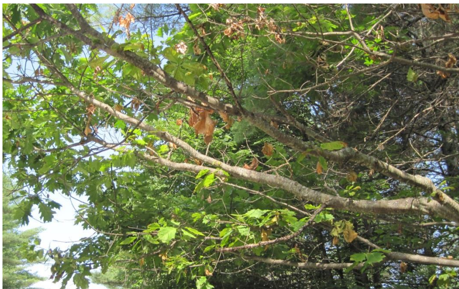
Oak dieback and symptoms, Standish, Maine.

Oak Dieback – Symptoms of oak dieback have been observed in Standish (Cumberland County) and a few surrounding towns over the past month. Symptoms include the drying and death of leaves and branch tips, often with a clearly delimited canker separating the dead portion from the live portion of the branch. Leaves on affected branches become brown and persist on the tree, at least for several weeks. Occasionally, twigs of branches more proximal to the stem are affected first, rather than those at the branch tip itself. Diagnostic efforts have not yet assigned a cause, but the symptoms appear similar to those caused by infection from the canker disease pathogen, Botryosphaeria ( Botryosphaeria corticola = Diplodia corticola ). This disease is generally considered to