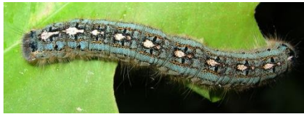
Late instar forest tent caterpillar with a line of footprint-shaped spots down its back.

Forest Tent Caterpillar ( Malacosoma disstria )– Forest tent caterpillars have been reported from Ashland and Island Falls (Aroostook County), Topsham and Woolwich (Sagadahoc County). This is one of several hairy caterpillars that people often lump with gypsy moth. It is a distinctive, hairy blue-tinged caterpillar which can be recognized by the line of white to off-white “footprints” along the center of their backs. Many guides call those spots “keyholes”, but it is easy to remember that: FOrest tent has FOotprints.