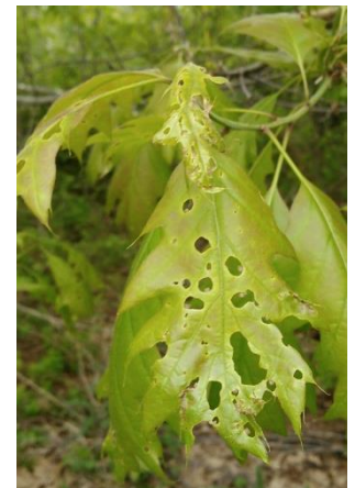
Shothole damage on red oak caused by Agromyza fly; June Hancock Co.

Oak Leaf Shothole Leafminer ( Agromyza viridula ) – Several cases of damage by the oak leaf shothole leafminer fly have been noted this year. The pattern of damage is such that this can be mis-diagnosed as winter moth or Bruce spanworm feeding damage. Usually pictures suffice to identify the fly damage. Most often what people note are the Swiss-cheese-like holes that