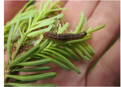
Late instar spruce budworm larva, June 20, 2015

different soil moisture regimes in untreated stands and a tour of the Baie-Comeau field laboratory. Sampling and management tactics were discussed. A variety of budworm life stages were present: Bt-killed and sickened larvae were observed as were healthy 6 th -instar larvae; pupae were abundant; and moths were emerging, mating and depositing eggs.