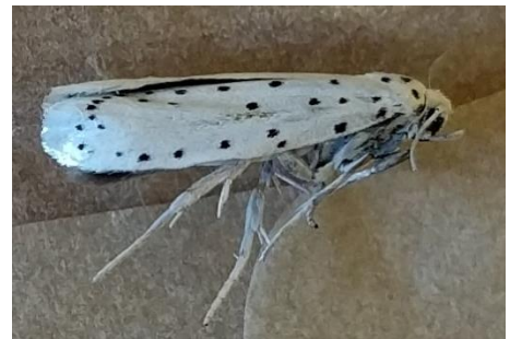
Moth whose larvae defoliated and webbed Tilia sp. in Hebron in June.

Probably an Ermine moth ( Yponomeuta sp.) – A spectacular display by uglynest caterpillars was reported in the last Conditions Report . It was an anticipated case of mistaken identification! Some caterpillars were kept for rearing due to uncertainty in the identification. The insects were easy to rear from late-instar caterpillars, and more than a half dozen moths were collected. However, visiting carpenter ants at the lab thought the carefully prepared specimens left to dry were a very cleverly plated feast (you knew they don't eat wood, right?). The webbing that decorated Tilia sp. in Hebron was most likely caused by an ermine moth species. The remaining intact moth (kept separate because it was too dry to pin), will be sent away for identification—probably a better avenue than making assumptions based on host and appearance (we've been down that road before, see June report). If that is not adequate for a firm ID, we'll be back in Hebron next June to take more samples for a positive ID on the phantom webber. So far light trap catches from two other locations – South Berwick and Freeport – have yielded similar moths.