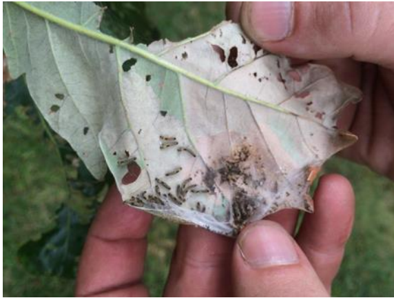
Immature browntail moth larvae in webbing on the underside of a leaf. Image: Maine Forest Service.

Browntail moth ( Euproctis chrysorrhoea ) – Browntail moth caterpillars are now hatching from their furry egg masses on the leaves of host trees – primarily oak and apple. The tiny larvae will feed by skeletonizing leaves and leaving the veins behind. Their feeding can be confused with that of fall webworm but the webworm larvae are over an inch in size now, whereas the browntails will be less than ¼ of an inch.