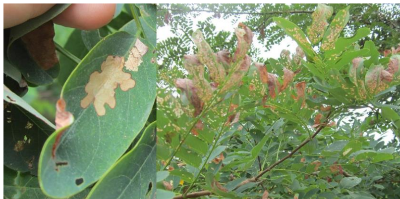
A mine of the locust digitate leafminer, a gracillariid moth (left) and larval mines and adult skeletonizing damage caused by the locust leafminer, a chrysomelid beetle (right), Old Town, ME.

In addition to the locust leafminer, mines of a delicate moth species, the locust digitate leafminer, can also be found on the foliage of affected trees. The previous outbreak of locust leaf-mining beetles in Maine caused branch dieback and some locust mortality. With the addition of the digitate leafminer, we may see more mortality – or it may all just go away.