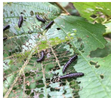
Alder flea beetle larvae feeding on speckled alder.

Alder flea beetles ( Altica ambiens ) – We have received several calls this month about alder flea beetles. The larvae of the beetles are sometimes mistaken for black ‘caterpillars’. They feed on tissue between the veins of leaves, leaving holes, and eventually skeletonizing the leaf. In observing the 1910’s outbreak of this insect, Woods recorded mortality of individual stems due to heavy feeding (MAES Bulletin 265, 1917). Although Maine is currently experiencing an outbreak of these insects this is not considered a significant pest in Maine due to the lack of economic importance of alder and the ability of alder, as a whole, to recover from epidemics.