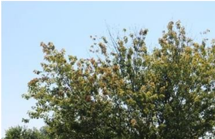
Typical thin crown and beginning top dieback in a maple tree.

Maple stress symptoms have been noticeable in different forms across Maine since early spring. Later growing season symptoms reported from various parts of Maine include premature fall coloration and progressive branch dieback in a top-down pattern.