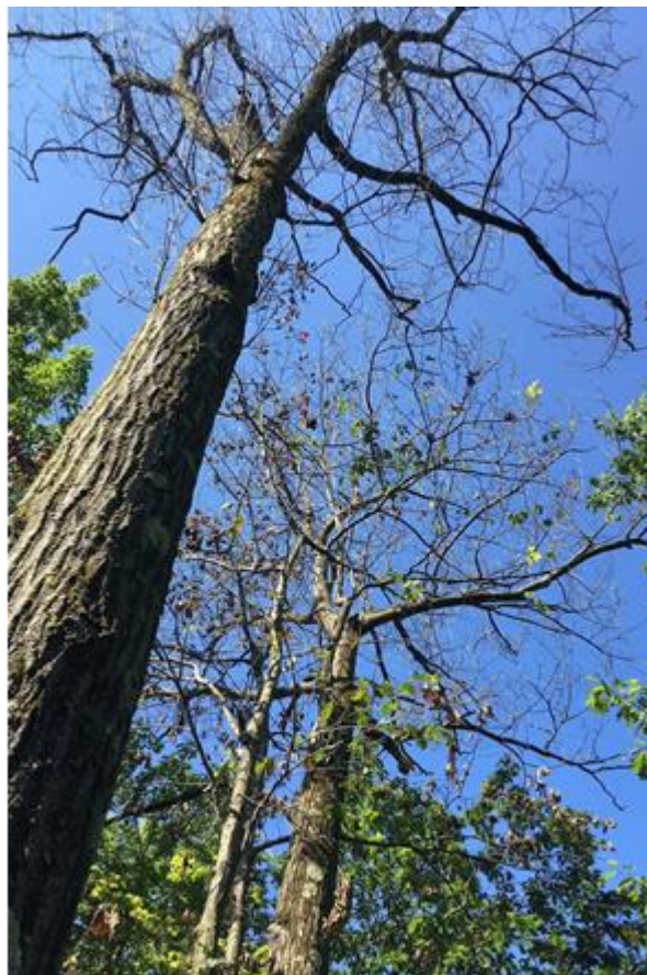
Above: Oak leaves shed in July from a tree in Pennsylvania confirmed to be infected with the oak wilt disease fungus. Right: In the foreground, tree that died from oak wilt disease and a smaller neighboring tree in decline due to the disease.

Underground root grafting junctions must be broken around infected trees to avoid spreading the disease to neighboring trees. This is accomplished by deep trenching around infected removed trees or efficient stump and root removal. Trees that die in the summer must be removed from the site and dried by debarking, splitting, chipping or burning the wood. This prevents the possible formation on cut trees of the spore-producing fungal pads that are effective in disease transmission.