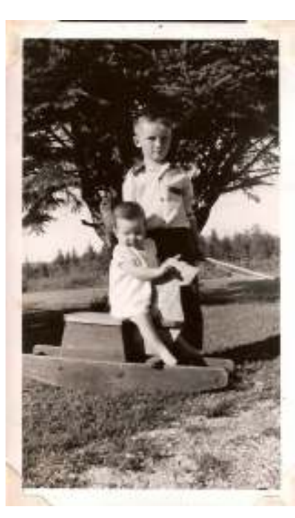
5<sup>th</sup> generation landowner, actively managing land connects me with relatives I never met.