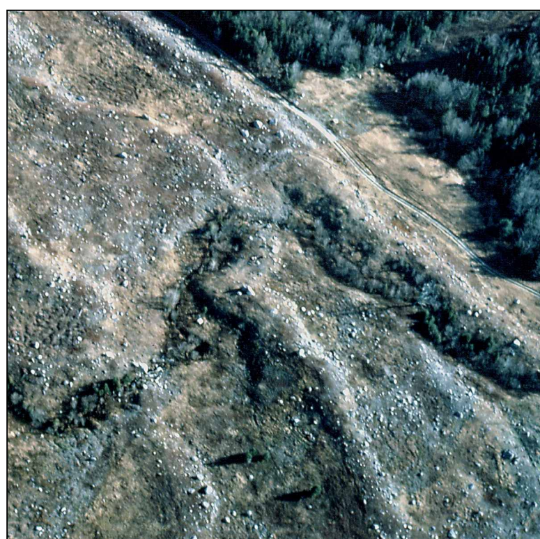
Figure 6: Aerial view of moraine ridges in blueberry field, Sedgwick (note dirt road in upper right for margin). Each bouldery ridge marks a position of the retreating glacier margin. The ice receded from right to left.