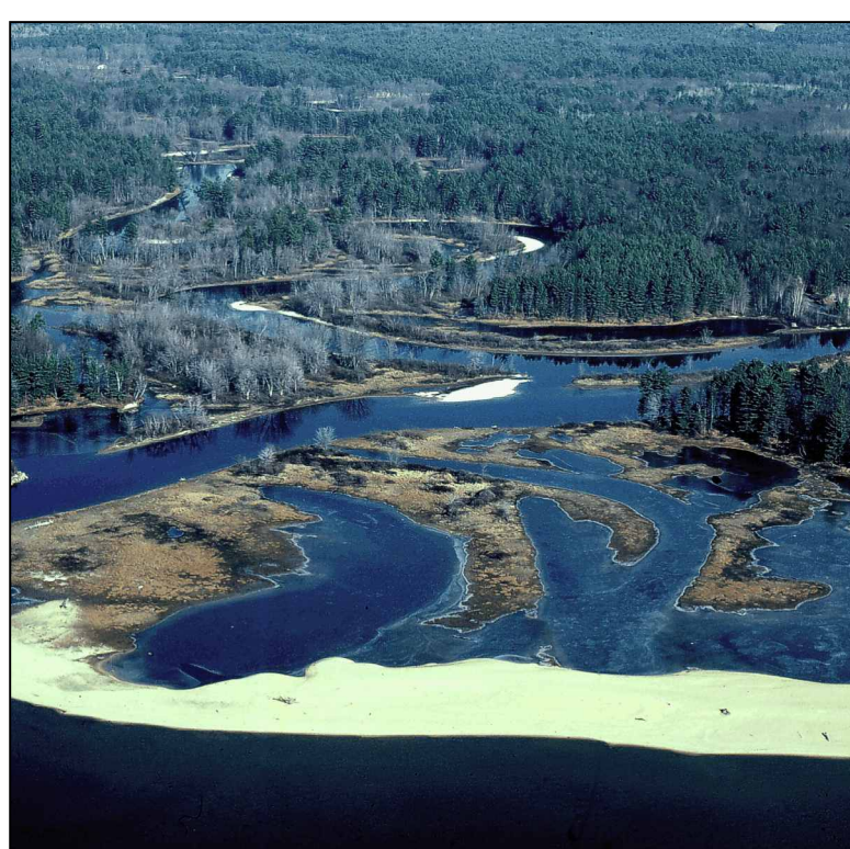
Figure 8: Songo River delta and Songo Beach, Sebago Lake State Park, Naples. These deposits are typical of geological features formed in Maine since the Ice Age.