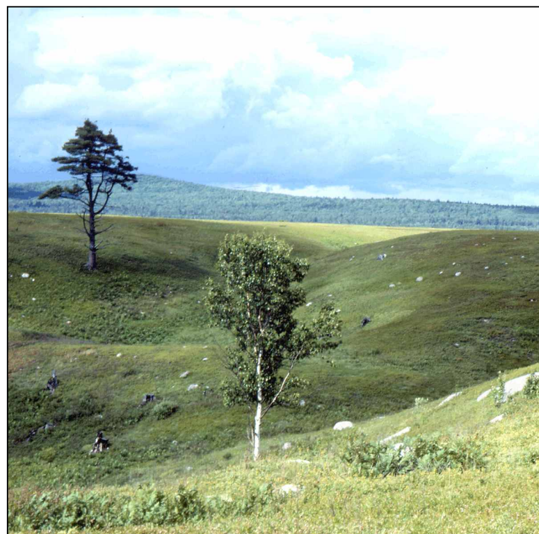
Figure 4: Glaciomarine delta in Franklin, formed by sand and gravel washing into the ocean from the glacier margin. The flat delta top marks approximate former sea level. Kettle hole in foreground was left by melting of ice.