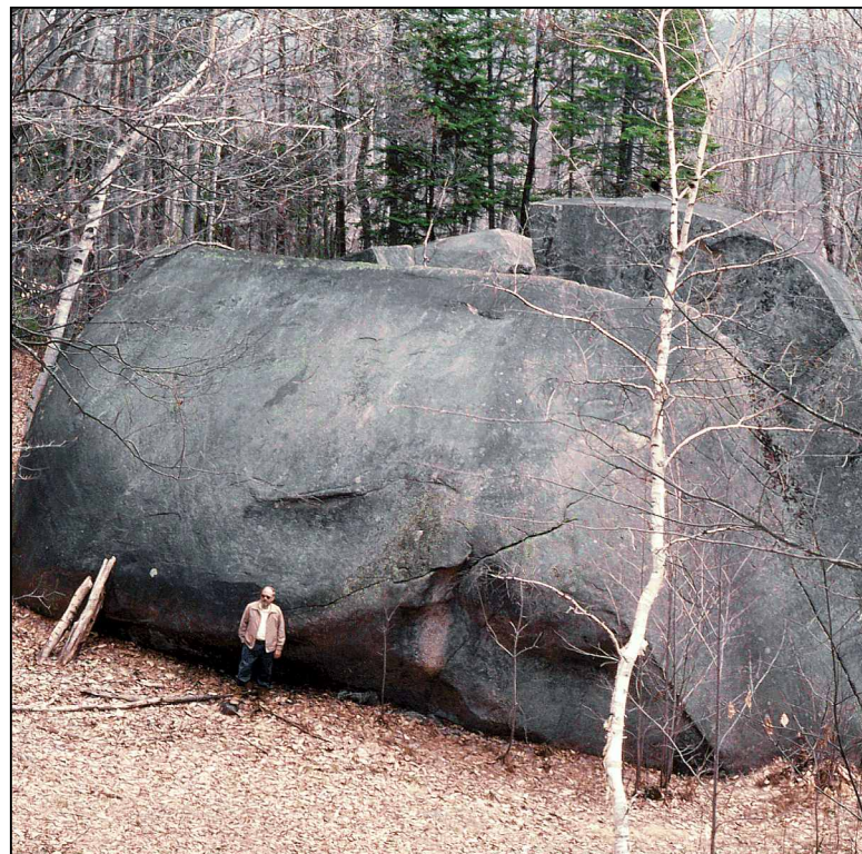
Figure 2: Dagget's Rock in Phillips. This is the largest known glacially transported boulder in Maine. It is about 100 feet long and estimated to weigh 8,000 tons.