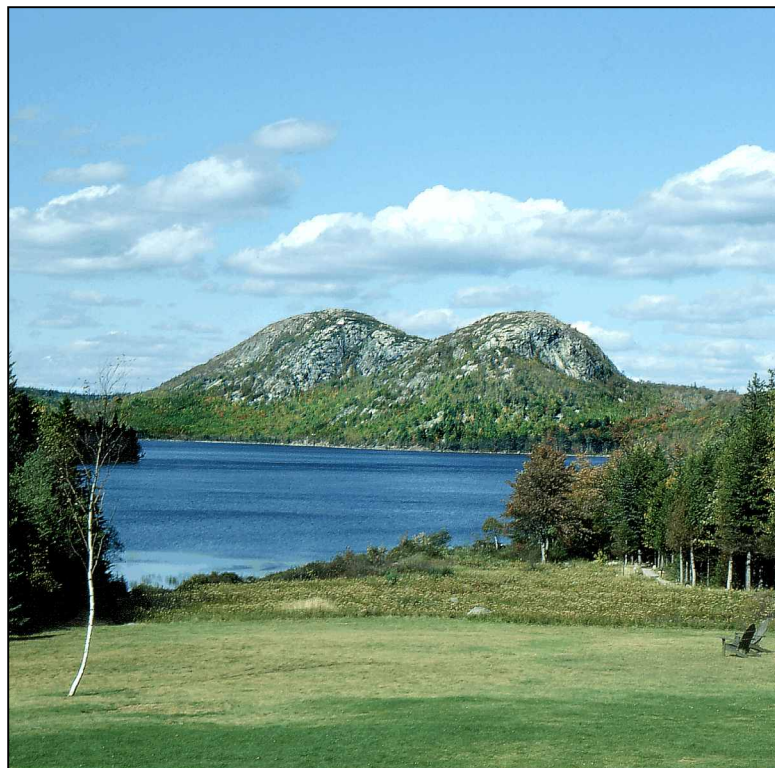
Figure 1: "The Bubbles" and Jordan Pond in Acadia National Park. These hills and valleys were sculpted by glacial erosion. The pond was dammed behind a moraine ridge during retreat of the ice sheet.