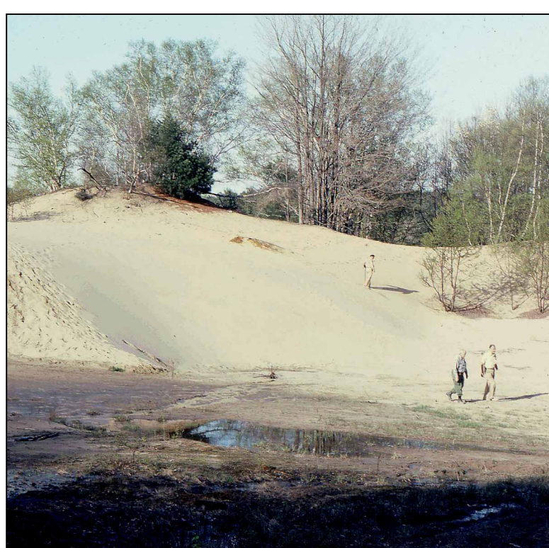
Figure 7: Sand dune in Wayne. This and other "deserts" in Maine formed as windstorms in late-glacial time blew sand out of valleys, often depositing it as dune fields on hillsides downwind. Some dunes were reactivated in historical time when grazing animals stripped the vegetation cover.