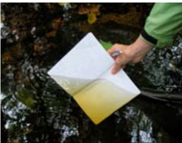
White notebook dipped into a stream that contains tannins

Beavers are slow travelers on land, making them easy meals for coyote, fisher, and bobcat. In the water, they are completely safe. Beavers constantly increase the size of their dam to widen their pond, shortening the distance they must travel over land to find food.