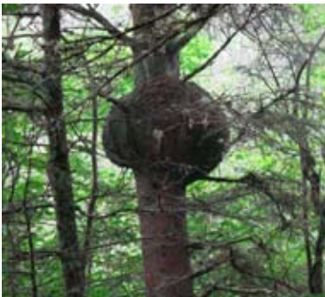
Burl on a white spruce

At 2.6 miles, turn right and head inland on the Black Point Brook Cutoff.