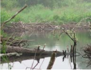
Beaver dam (not visible from trail)

At 3.4 miles, turn right at the T to start the last leg of the loop. The trail grades in and out of woodlands, shrub wetlands, and spruce - fir forest paralleling Schooner Brook.