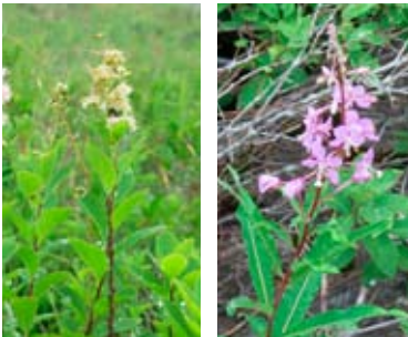
Meadowsweet (L) and fireweed (R)

Tall Grass Meadows are a more defiant component of an ecosystem than was once thought. For many years, ecologists believed that Tall Grass Meadows like this one needed periodic natural fires in order to avoid being overtaken, or succeeded, by larger shrubs and trees. It is more likely, however, that this meadow was a forest until it was burned by farmers in the 1800s to clear land for sheep or cattle farming; it has persisted as a Tall Grass Meadow ever since. This meadow owes its perseverance to the roots of bluejoint grass, which form nearly impenetrable mats preventing many other species from germinating here.