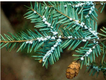
Hemlock woolly adelgid infested branch (Photo: USFS).

While it is unlikely that we humans can eat our way out of our knotweed problem, research is currently being done to determine if the psyllid Aphalara itadori — an insect species endemic to Japan specializing on Japanese knotweed — can be safely released in the United States.