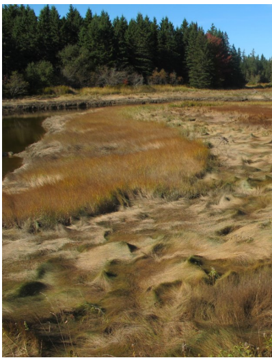
Typical saltmarsh vegetation, with smooth cordgrass ( Spartina alterniflora ) low marsh adjacent to the river channel and matted saltmarsh hay ( Spartina patens ) high marsh in more elevated areas.