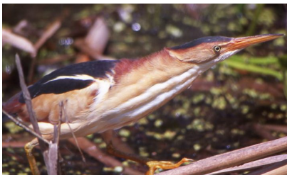
Maine is the northern edge of the least bittern's breeding range.