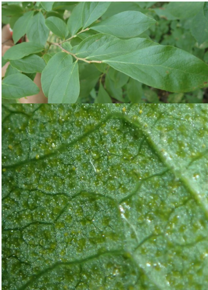
Huckleberry ( Gaylussacia sp.) can be distinguished from other members of the blueberry family by resin glands on the underside of the leaves.