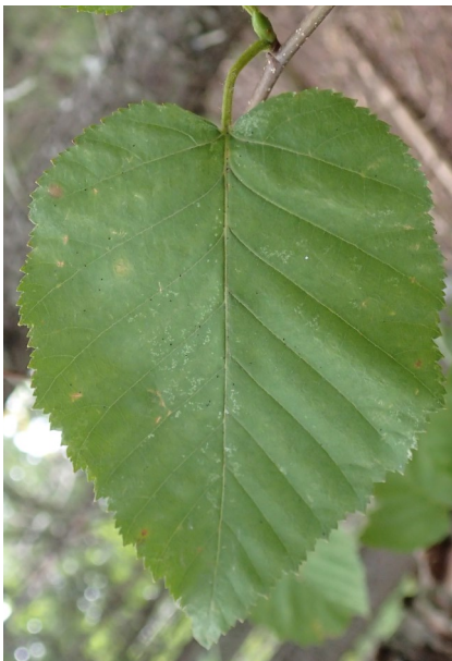
Heart leaved paper birch is a common tree of subalpine settings in Maine. It can be distinguished by its cordate (heart shaped) leaf base.