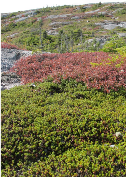
Crowberry, foreground, is in stark contrast with alpine bilberry (red leaves, at center) in late summer. These are among the common alpine plants found on the Little Jackson summit.

per birch is often the first tree species to colonize bare ground. Birches produce many small, long lived, wind dispersed seeds which grow more rapidly in full sunlight than other tree species. Heart-leaved paper birch is a short lived, shade intolerant species that does not regenerate under a closed canopy forest. At this site, it will eventually be replaced as the dominant tree by conifers including red spruce and balsam fir.