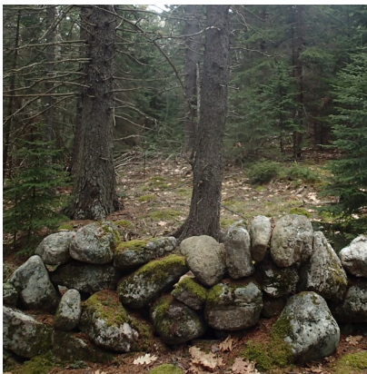
19th Century rock walls memorialize the boom in sheep herding at that time.