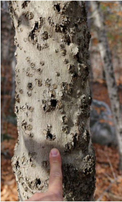
Diseased beech tree, with numerous lesions associated with beech bark disease.