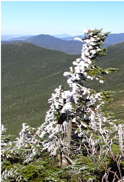
Krummholtz trees are exposed to harsh weather throughout the year.