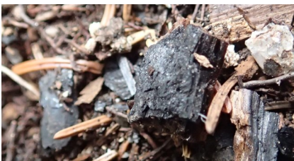
Charcoal found in the soil provides evidence of historic wildfire.

and western Maine, including greater Weld, has been touched by this history.