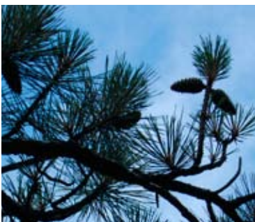
Pitch pine needles, bark, and cones