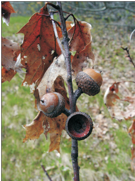
Red Oak Twig with Acorns

These woodlands occupy dry ridges and south facing slopes on thin, excessively well drained and stony soils. Known sites are in extreme southern Maine only, on granite-syenite bedrock.