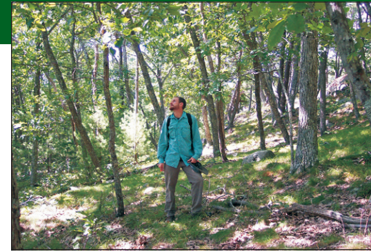
Chestnut Oak Woodland

hardwood trees and shrubs. The suppression of fire could therefore result in the gradual conversion of these woodlands to a more mesic oak-pine type. In Maine, chestnut oak does not seem to regenerate well under its own canopy.