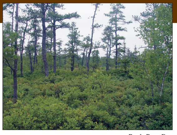
Pitch Pine Bog

Birds associated with this community include wetland species such as the common yellowthroat and northern waterthrush.