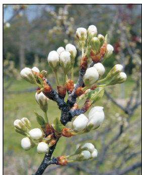
Beach Plum in Bud

Sites occur on open coastal dunes. The sandy substrate of this community is very dry, acidic, and nutrient poor, resulting in stunted tree growth. Only limited herbaceous species are able to tolerate the oceanside conditions.