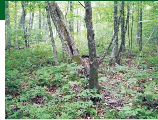
Sugar Maple Forest

often occur on drier sites (e.g., ridgetops) and/or more acidic soils (e.g., granitic types in Downeast Maine).