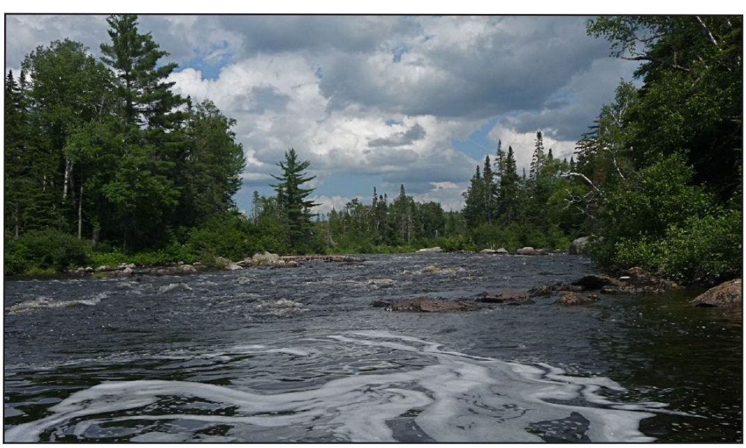
Moose River, Maine Natural Areas Program