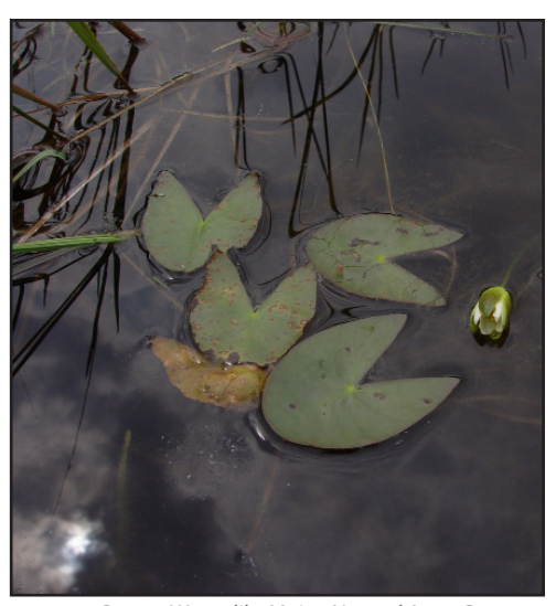
Pygmy Water-lily, Maine Natural Areas Program

The fragrant cliff wood-fern ( Dryopteris fragrans ) is a small, aromatic, evergreen fern found on cool, shaded rocky outcrops and dry cliffs, often in crevices. It is Endangered in Maine, where it is at the southern limit of its range. Distinguishing features of this fern are the persistent, dead fronds found at