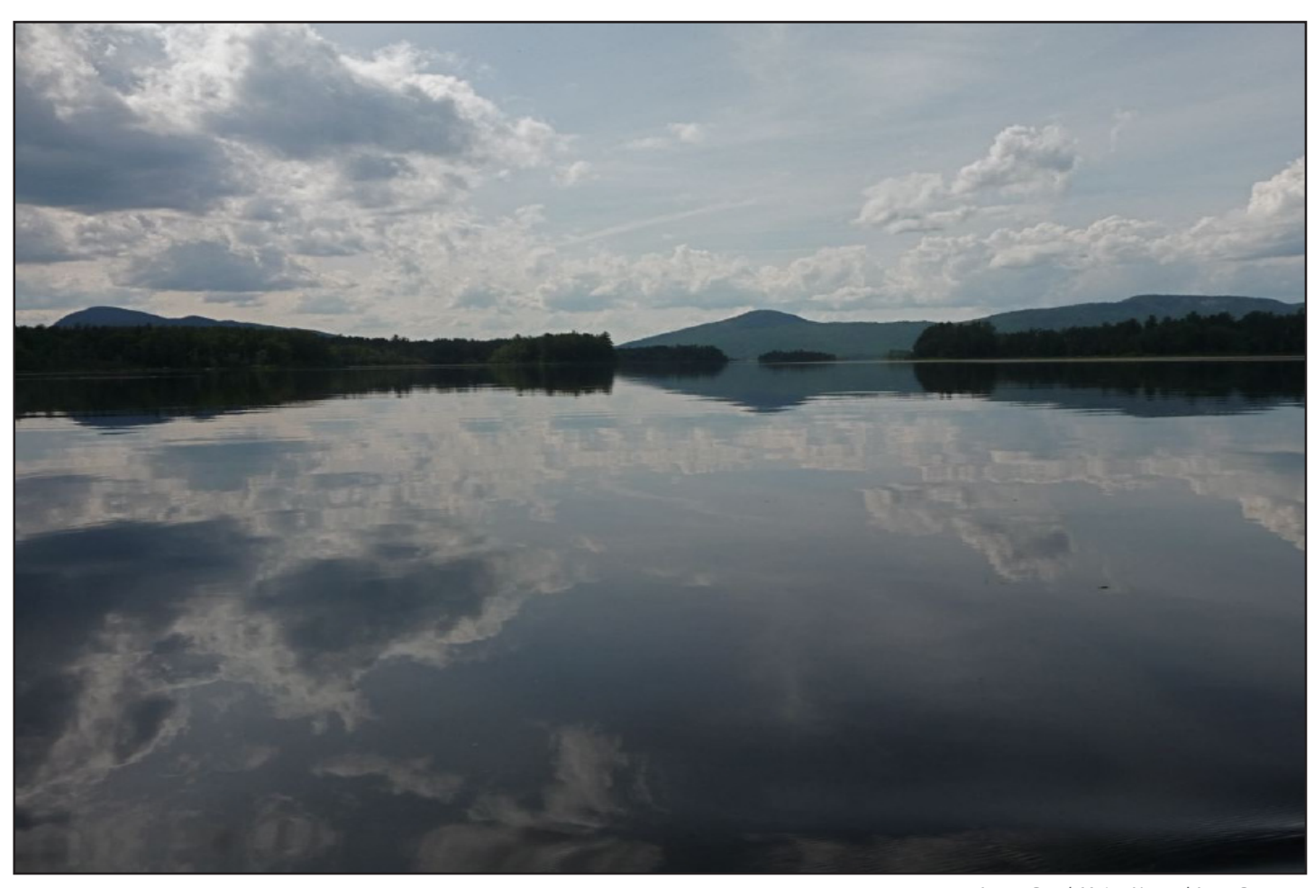
Attean Pond, Maine Natural Areas Program