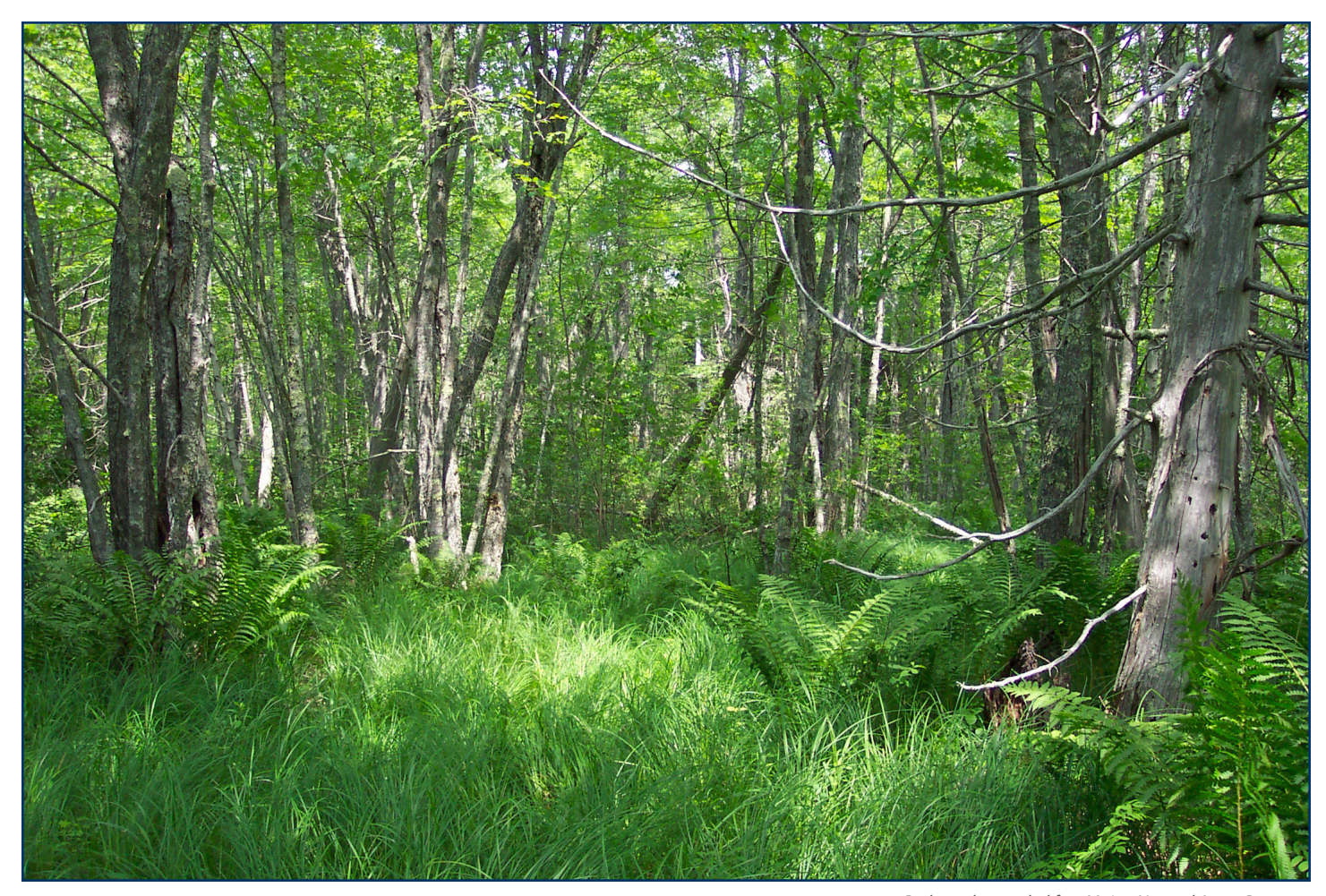
Red maple wooded fen, Maine Natural Areas Program