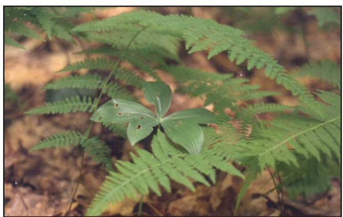
Above: Blanding's Turtle, MDIFW Below: Small Whorled Pogonia, MNAP

a hardpan impedes water percolation into the soil. Associated understory plants include Indian cucumber-root, New York fern, partridge berry, and rattlesnake plantain.