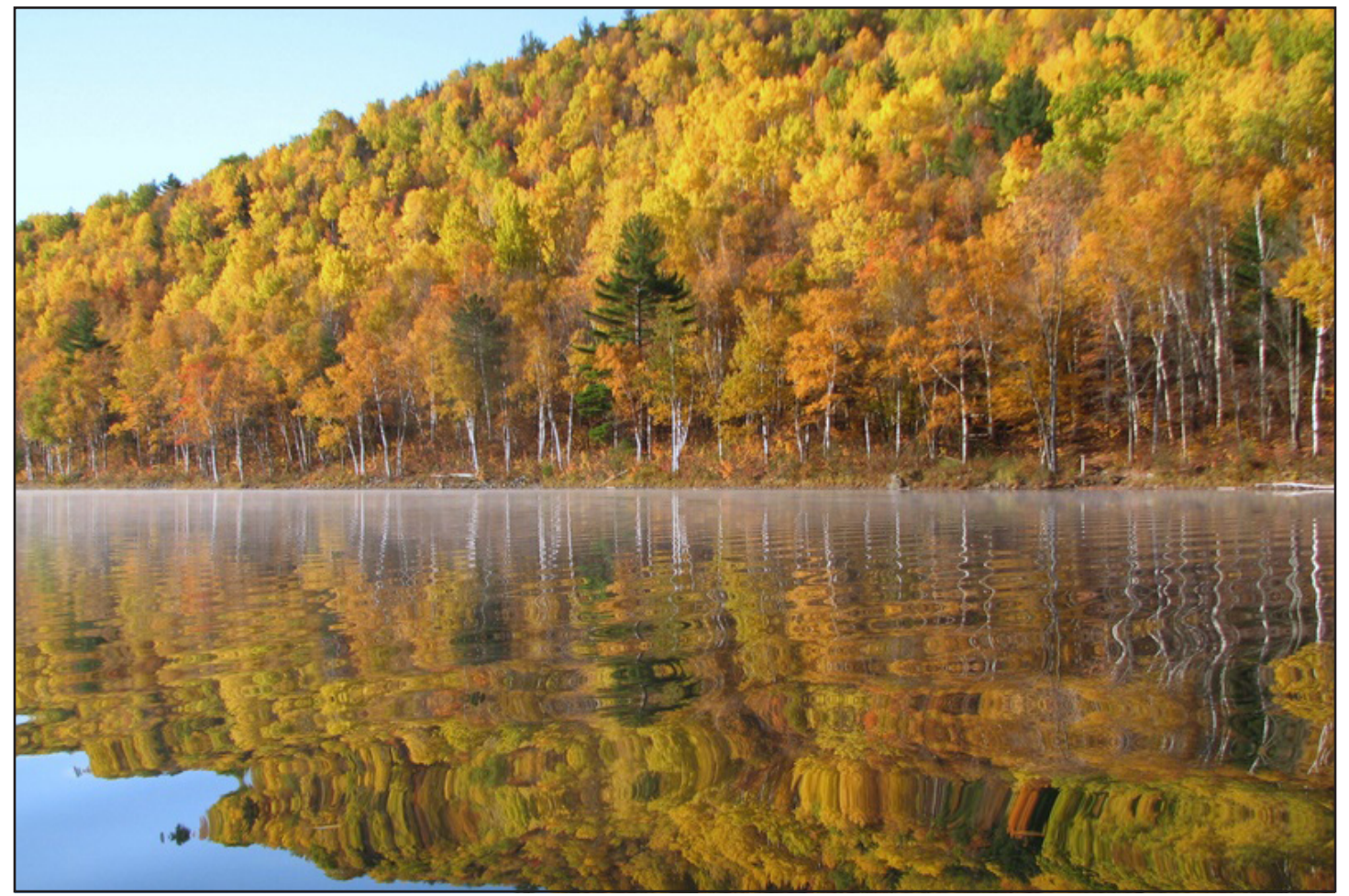
South Branch Pond, Ron Logan

what stunted trees, dominated by balsam fir and heart-leaved birch. Where wind, fire, or landslides have created openings, the canopy may be dominated by heart-leaved birch and mountain ash, with a dense shrub layer of mountain ash, hobblebush, and regenerating fir. Common herbs include wood ferns, bluebead lily, northern wood-sorrel, and big-leaved aster. Disturbances, including landslides, can be important in shaping this community. Fir waves, an unusual landscape pattern of linear bands of fir dieback and regeneration, are often a feature of this community.