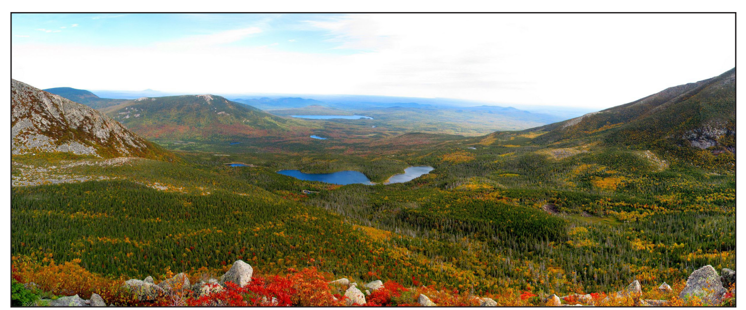
View from Hamlin Ridge, Craig Snapp

The Baxter Region Focus Area includes over 7,000 acres of Inland Wading Bird and Waterfowl Habitat . These areas provide undisturbed nesting habitat and undisturbed, uncontaminated feeding areas and are essential for maintaining viable waterfowl and wading bird populations. Ninety-five acres of Deer Wintering Area , areas which provide reduced snow depths, ample food and protection from wind for deer