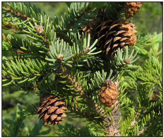
Black Spruce Cones, Maine Natural Areas Program

» Forested areas surrounding the lakes, ponds, streams, and wetlands are vital to the ecological health of the water bodies and wetlands within the focus area. These buffers also provide valuable riparian habitat for many wildlife species. In particular, intact forested buffers around spring salamander streams protect the water quality and temperature of the streams and are used by the salamanders for foraging and dispersal. A 250 foot buffer from development and road-building and a 150 foot riparian management zone for forestry activities is recommended within ¼ mile upstream or downstream from documented spring salamander habitat. When planning forestry activities within this riparian zone, foresters are encouraged to consult with an MDIFW biologist.