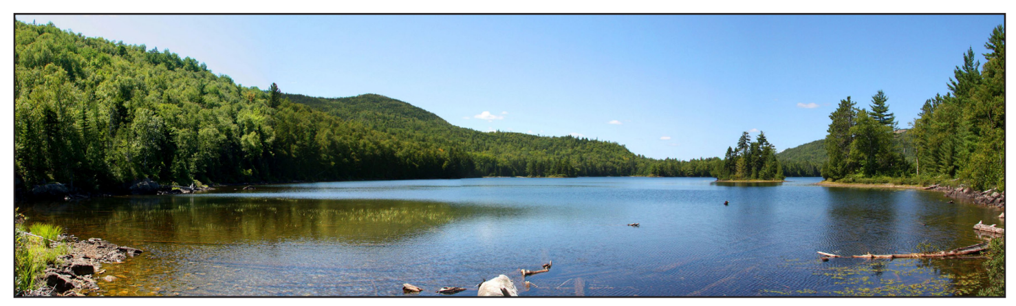
Billfish Pond, Craig Snapp

in winter, are present here. High value habitat for wild brook trout , an important recreational fish, can be found here as well. Maine has some of the best remaining habitat for Eastern brook trout anywhere.