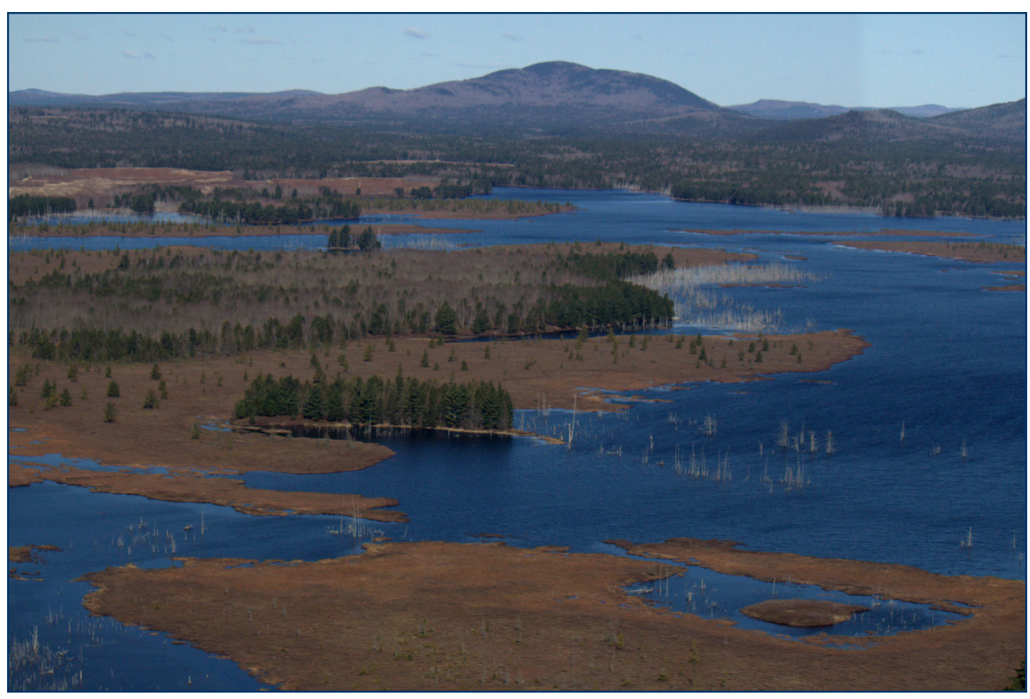
Bog Brook Flowage, Rich Bard