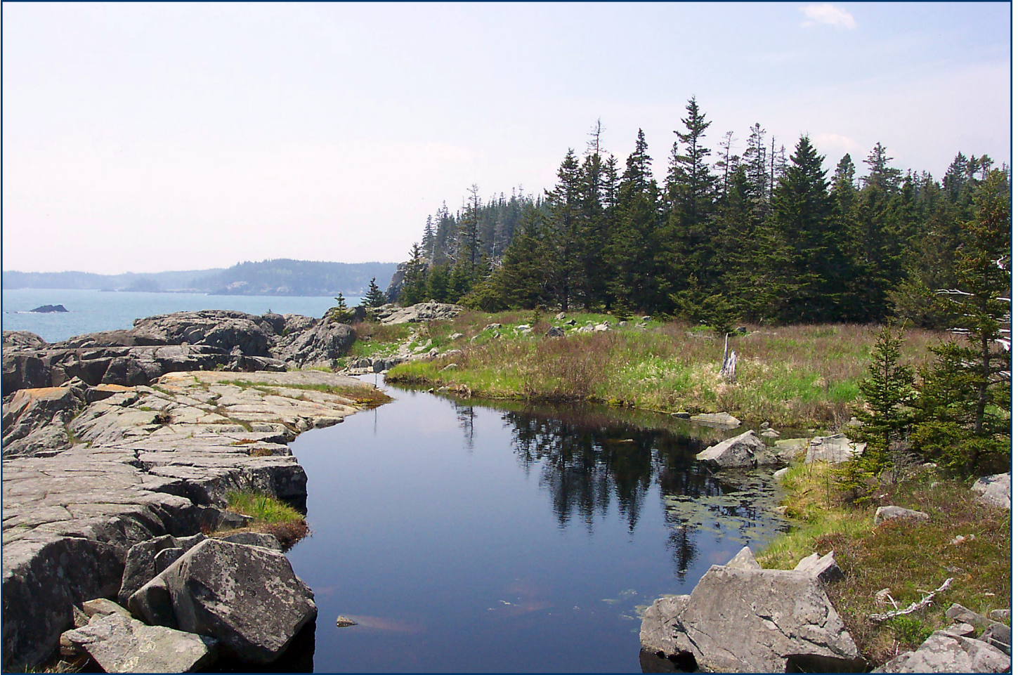
Maine Natural Areas Program