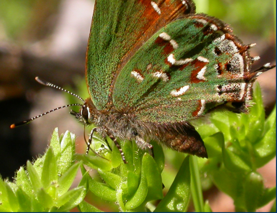
Above- Small-whorled pogonia, Below- Juniper hairstreak