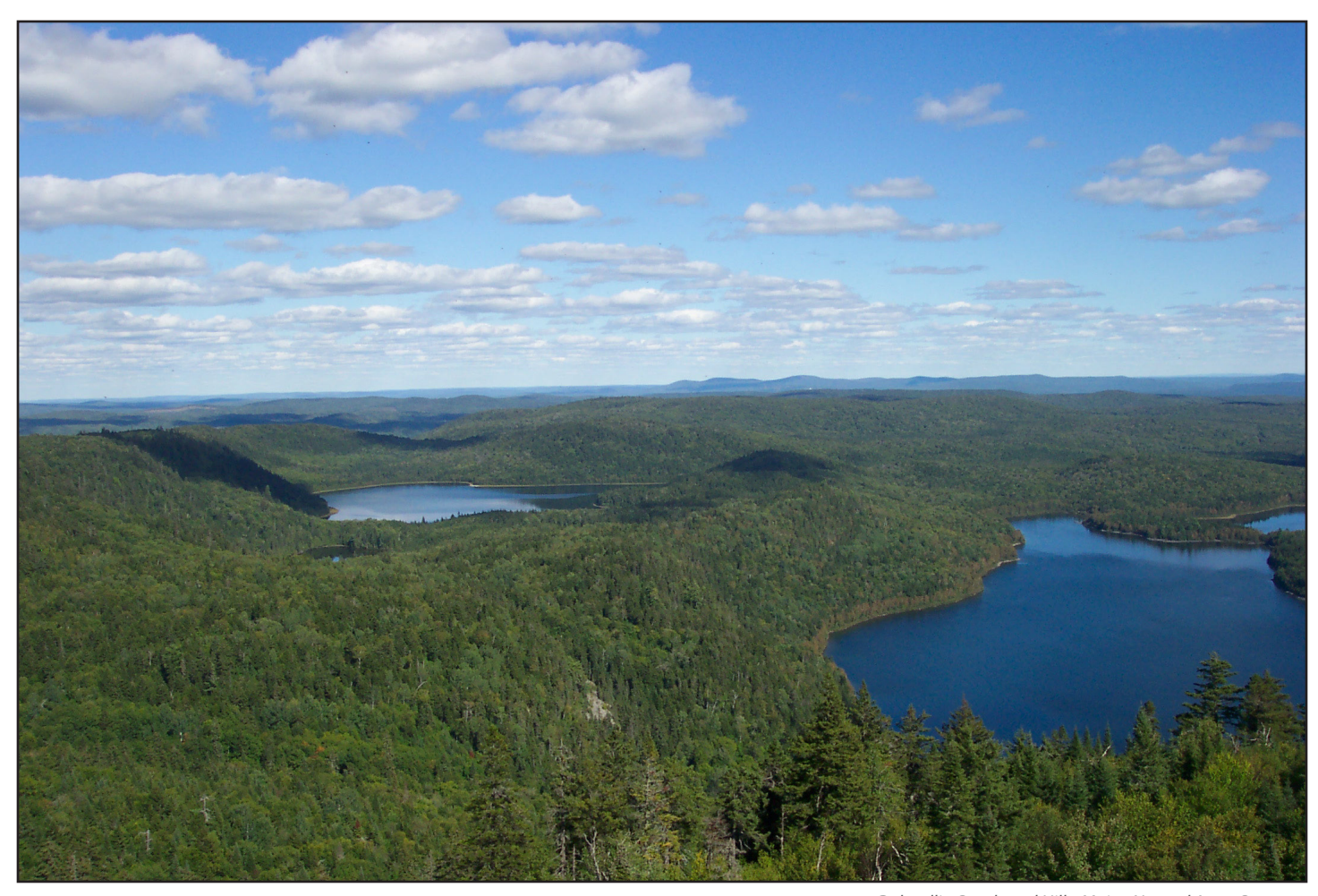
Deboullie Ponds and Hills, Maine Natural Areas Program