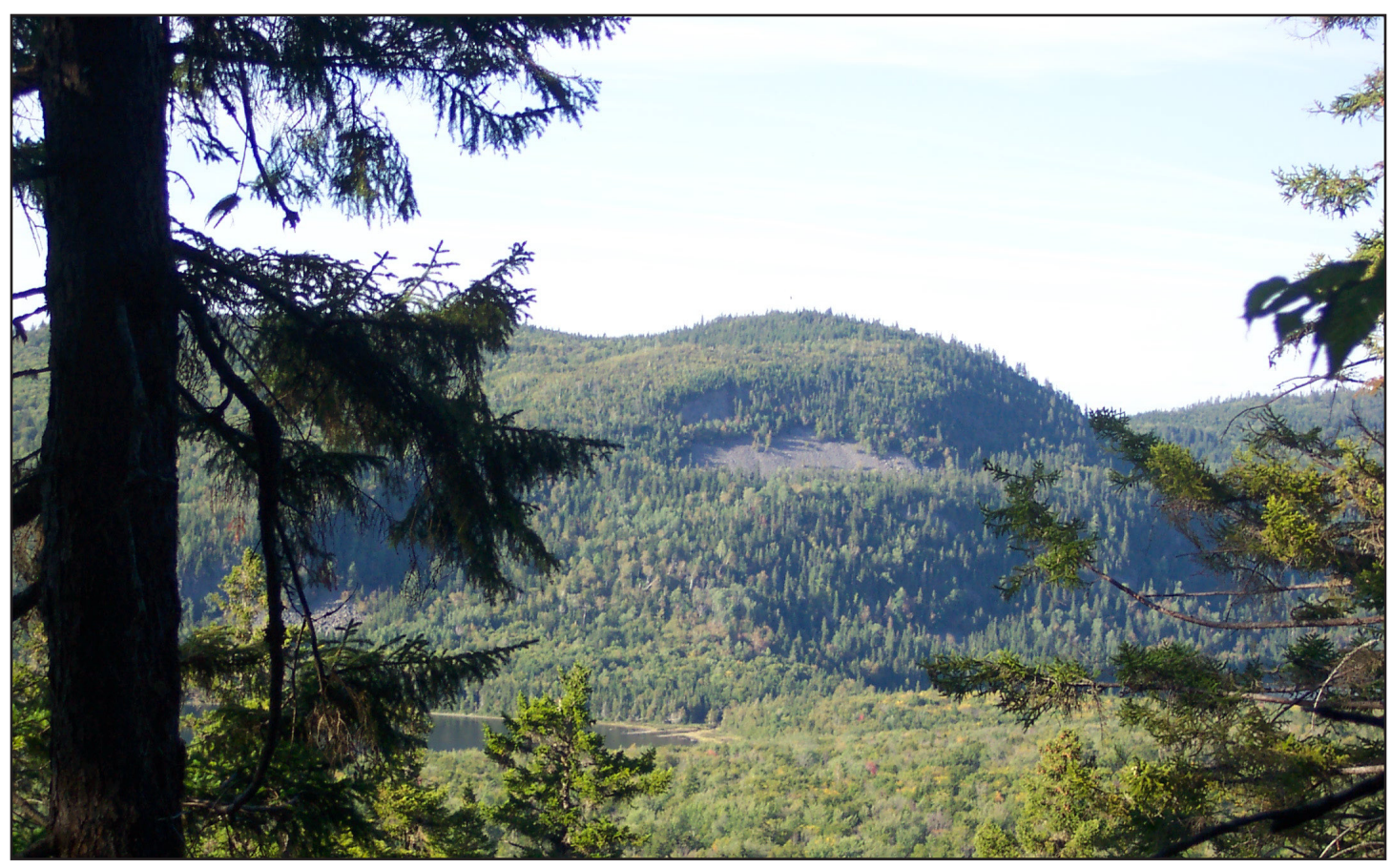
Deboullie Ponds and Hills, Maine Natural Areas Program

type is found in the focus area between Black and Togue Ponds in several patches encompassing over 900 acres total.