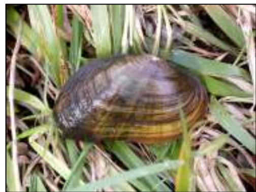
Brook floater ( Alasmidonta varicosa ) (Photograph by Ethan Nedeau).

Another threatened mussel species, the brook floater ( Alasmidonta varicosa ), was found on the West Branch and the East Branch of the Mattawamkeag River on the east side of Pleasant Lake, adding to the overall mussel diversity of this focus area. The brook floater is found among rocks, gravel, and sand in creeks and small rivers. In Maine, this species is generally found among rooted aquatic vegetation in nutrient-poor streams. The brook floater has experienced significant