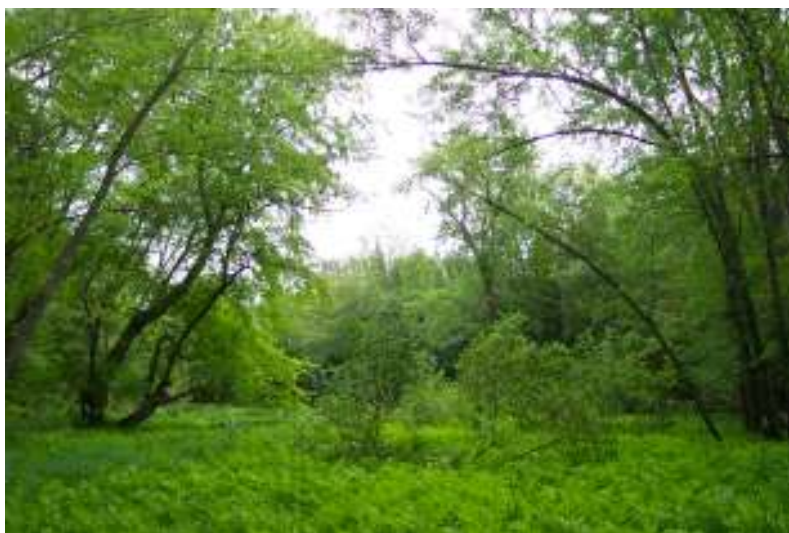
Silver Maple Floodplain Forest along the West Branch Mattawamkeag River.

The Greater Mattawamkeag Lake Focus Area encompasses a broad swath of uplands and wetlands surrounding Upper Mattawamkeag and Mattawamkeag Lakes, extending from Sly Brook in the southwest to Pleasant Lake in the northeast. The combination of open wetlands, small ponds, rivers, and undeveloped shorelines with hills and low peaks provides this area with a unique combination of natural features including rich plant and animal species diversity.