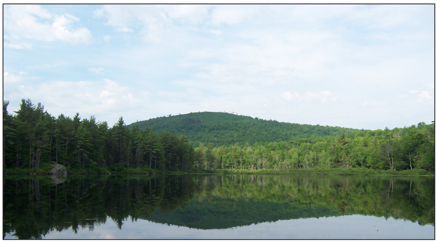
Kennebec Highlands, Maine Natural Areas Program

provide a popular fishery. Wild brook trout , for example, are present in Stoney Brook, Roaring Brook, Beaver Brook, Kimball Brook, Upper Mill Stream and some unnamed tributaries.