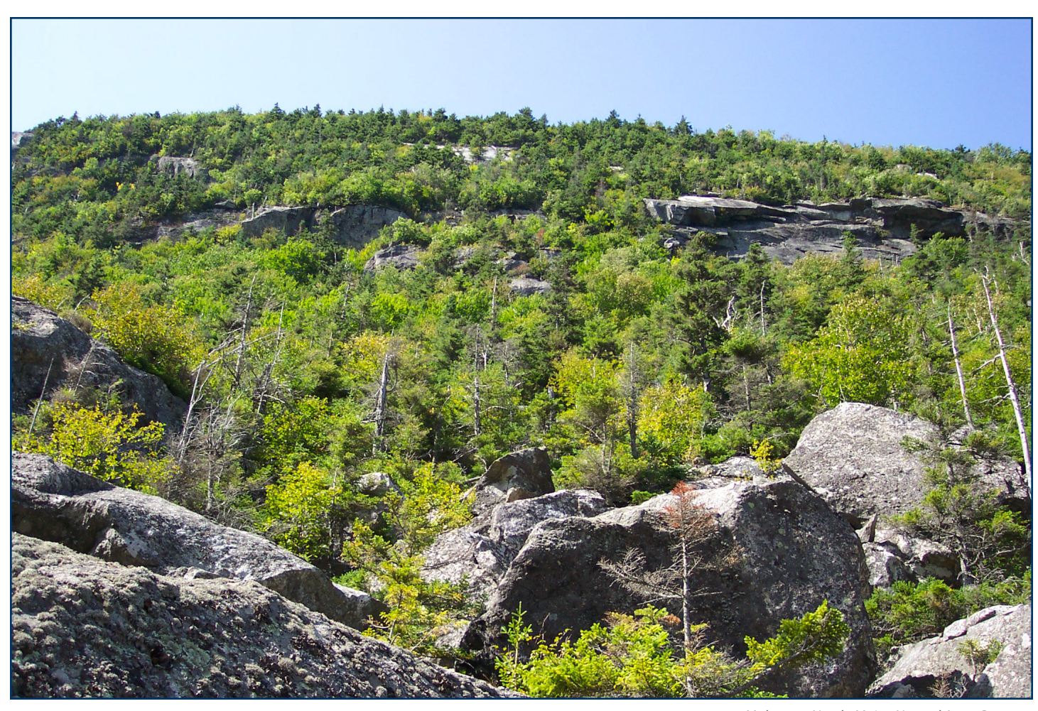
Mahoosuc Notch, Maine Natural Areas Program