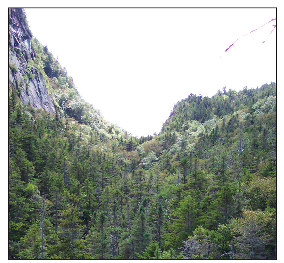
Mahoosuc Notch, Maine Natural Areas Program