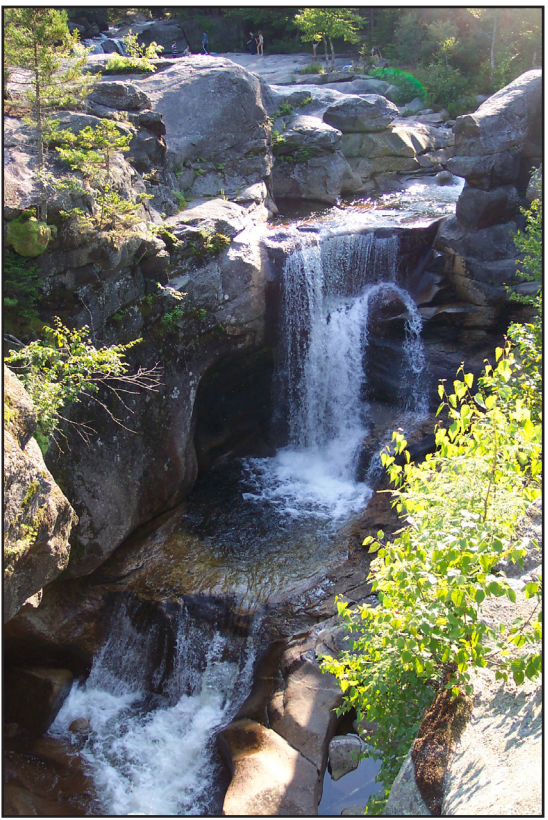
Screw Auger Falls, Maine Natural Areas Program