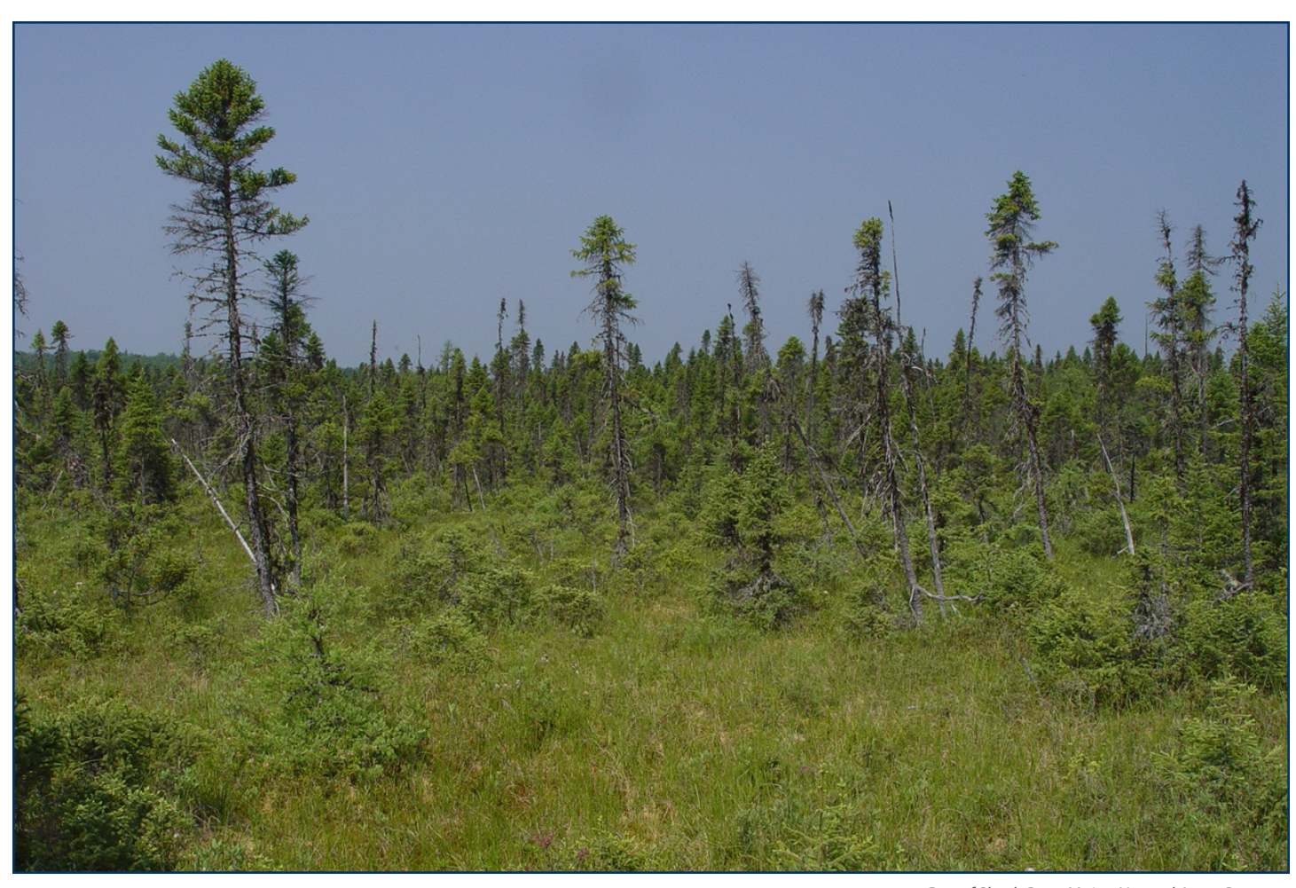
Dwarf Shrub Bog, Maine Natural Areas Program