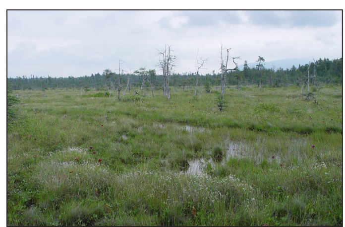
Low Sedge Fen, Maine Natural Areas Program

growth rates, due to the nutrient poor environment, result in slow recovery from physical disturbances. Degradation from recreational use is unlikely, because of the unstable substrate; but if disturbance, such as foot traffic, is a necessity, traversing during frozen conditions or using boardwalks can minimize impacts.