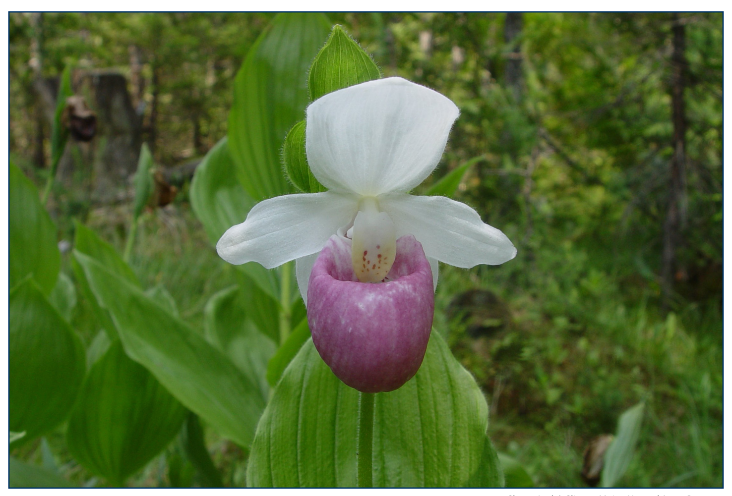
Showy Lady's Slipper, Maine Natural Areas Program