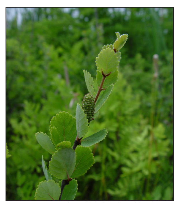
Swamp Birch, Maine Natural Areas Program

Swamp birch (Betula pumila), also called dwarf or low birch, is a medium-sized shrub, 0.3-3 m high, with small, distinctively shaped leaves. The leaves, borne alternately on the dark twigs, are almost round in outline, with very coarse teeth around the leaf margin; they are lighter green or whitish beneath. The aments (elongate fruit clusters typical of birches) are borne upright and are about 2-3 cm in length. It is a perennial woody shrub; deciduous leaves. Flowers in May and June.