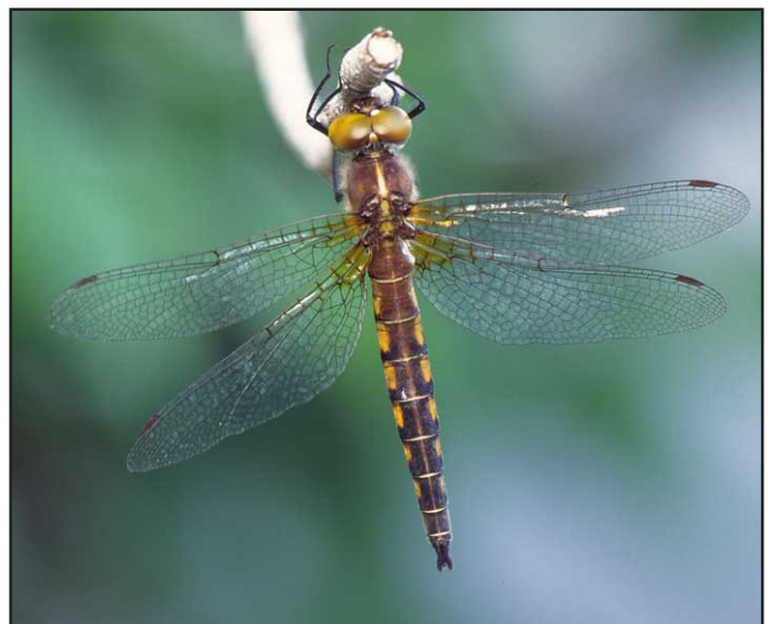
Broadtailed Shadowdagon Male, B. Nikula