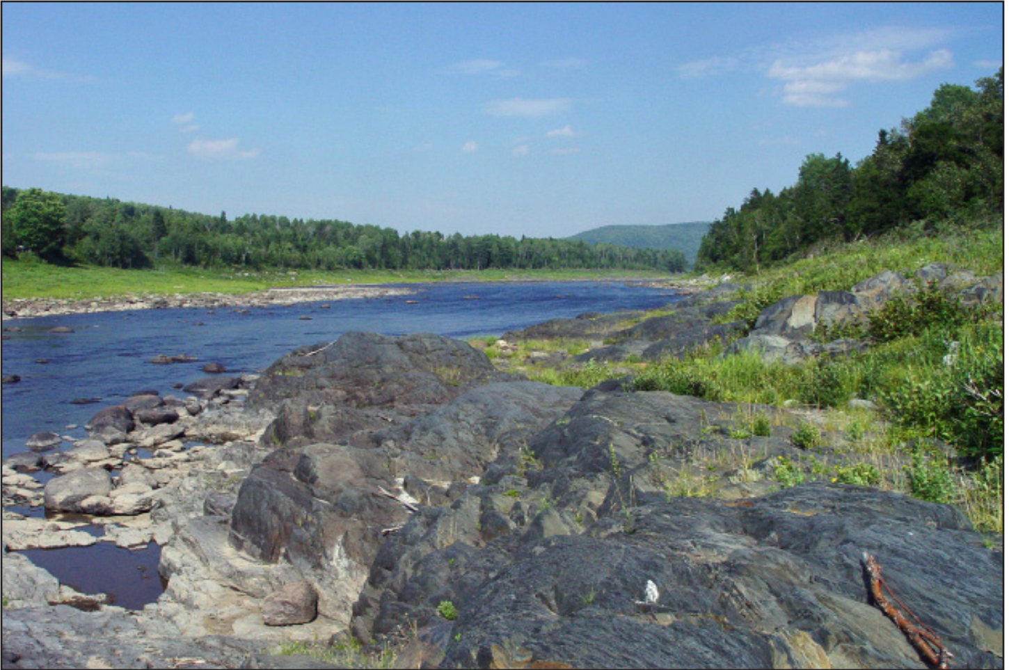
St. John River, Rivershore Outcrop, Maine Natural Areas Program