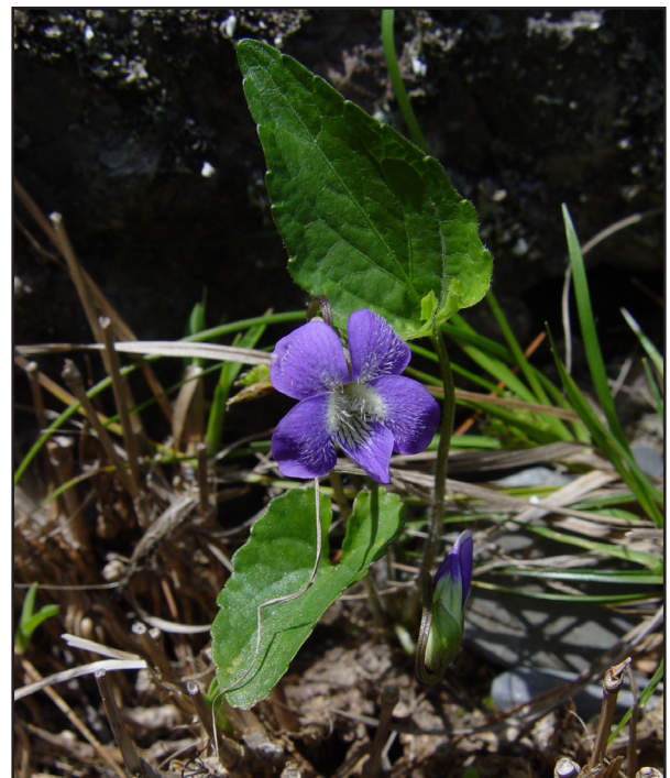
New England Violet, Maine Natural Areas Program

Swamp birch ( Betula pumila ), also called dwarf, bog or low birch, is a medium-sized shrub of Special Concern, found in bogs and wooded swamps. The small, distinctive leaves are almost round, lighter green or whitish beneath, with coarse teeth along the edges. New leaves are fuzzy when young but