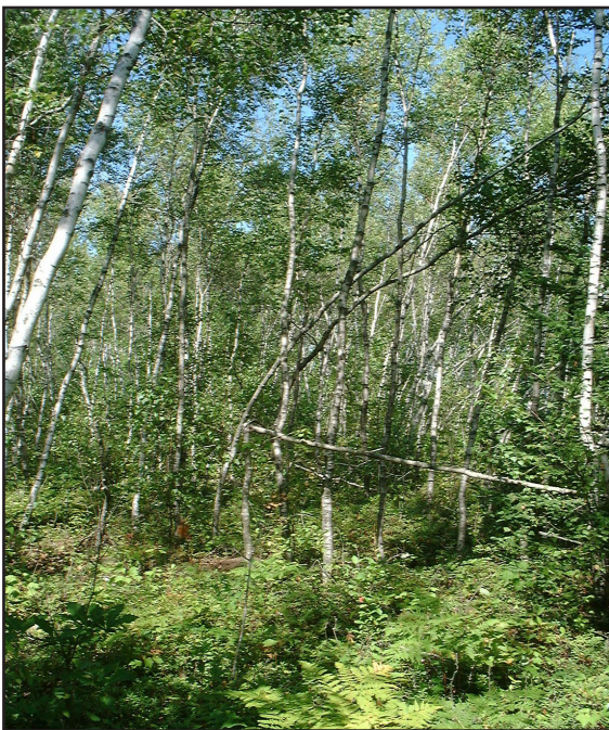
Early Successional Forest, Maine Natural Areas Program

Fisheries resources in this section of the main stem St. John River were historically for wild brook trout. Although populations of trout may still exist in some of the cold tributaries in this section of the St. John, muskellunge are now the most prevalent sport fish. Muskellunge were introduced into Lac Frontier, Quebec commencing in 1970 by government biologists and have now spread throughout the St. John drainage from headwaters to the Bay of Fundy. Smallmouth bass are also now present in the St. John River as the result of an illegal introduction in a tributary system located in New Brunswick