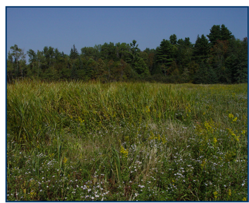
Brackish Tidal Marsh, Maine Natural Areas Program