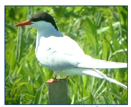
Arctic Tern, Unknown