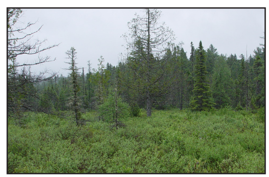
Circumneutral Fen Natural Community, Maine Natural Areas Program

target for forest management. In some areas these fens have been altered by beaver activity. Conifer-preferring birds that may use this partly open type include black-backed woodpecker, palm warbler, common yellowthroat, Lincoln's sparrow, and Swainson's thrush. Cedar fens that have a large number of dead trees provide habitat for the three-toed woodpecker.