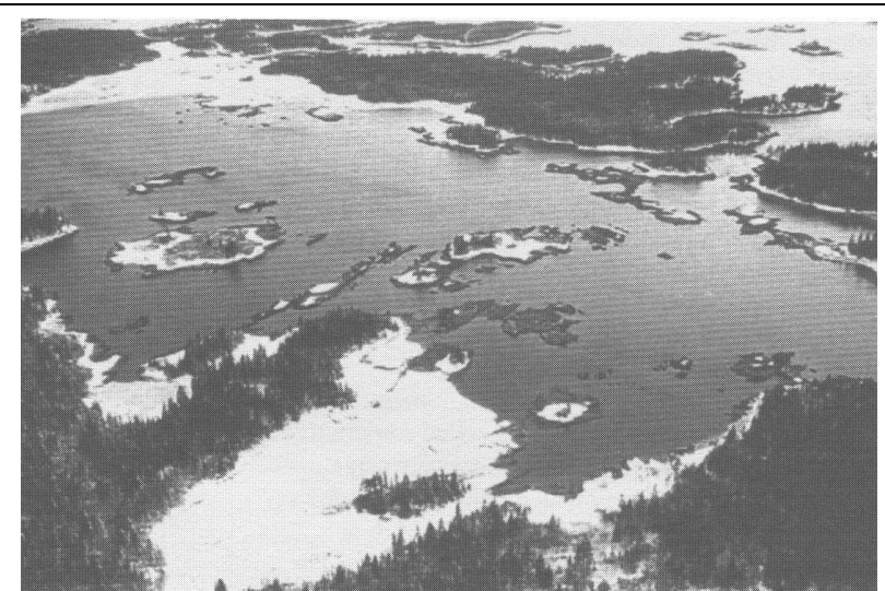
Most of the land area surrounding The Basin on the west side of Vinalhaven has been protected by conservation easements.

Black's Law Dictionary defines an easement as a "right of use over the property of another." Easements are generally limited to a specific purpose and do not impose an obligation on the landowner or confer special rights to the holder of the easement beyond its stated purpose.