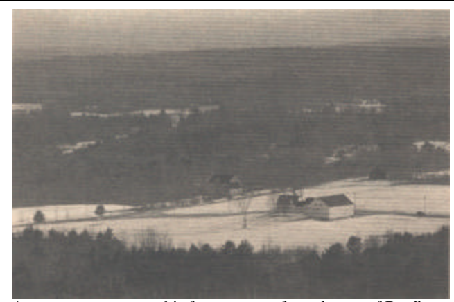
An easement protects this farm, as seen from the top of Bradbury Mountain State Park.

3. Accepting public easements. A municipality may offer or be asked to accept an easement offered by a private landowner. There may be considerable public value in accepting the easement, but not if it's offered simply to reduce taxes without a corresponding public benefit. An example of a conservation easement with a public benefit would be a hiking trail in a scenic area, or public access to a water body. In weighing whether or not to accept an easement, the municipality should understand its maintenance obligations, the duration of the easement, and the rights which the property owner retains and whether those rights would interfere with the public benefit.