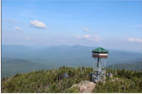
Communications Tower on Mount Blue, Avon In Mount Blue State Park

requirement to charge lease fees based on these values. The camplot program also administers 8 tent site rental agreements.