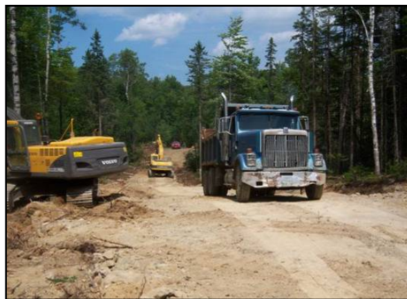
Management Road Construction at Nahmakanta

The Bureau continued to improve road access within its public lands, focusing primarily on recreational needs and implementation of its timber management program. There are currently about 263 miles of public use roads on Public Lands.