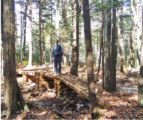
A Mt. Bike-Friendly Bridge Constructed in the Pineland Public Lands

Bigelow Preserve. A 900 hour Maine Conservation Corps Environmental Steward position assisted management efforts and visitor education at the Preserve. Work was completed on the Gravel Pit Campsite near Little Bigelow. The Safford Brook Trail relocation was finished. Existing campsites were renovated and internal pathways between the multiple sites were cleared at Round Barn.