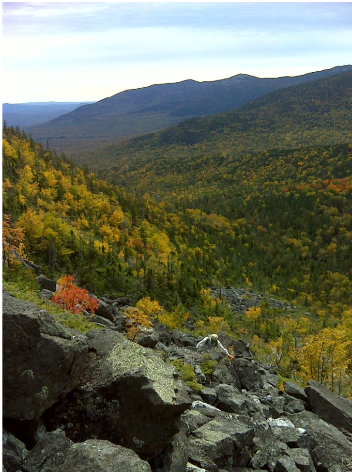
Crocker Mountain Unit

MAINE DEPARTMENT OF AGRICULTURE, CONSERVATION AND FORESTRY Bureau of Parks and Lands