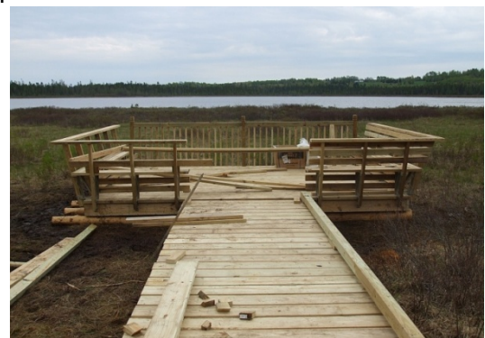
Salmon Brook Lake Bog observation platform during construction

Salmon Brook Lake Bog. MCC and regional staff constructed 1.0 miles of hiking trail, a footbridge, and 100' of boardwalk at Salmon Brook Lake Bog (with Recreational Trails Program funds). A road project funded by the Land for Maine's Future was completed.