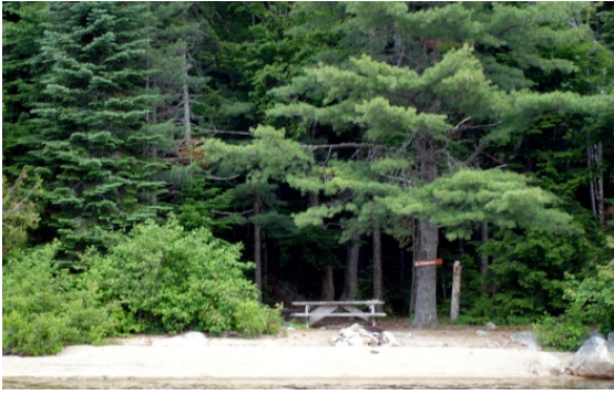
Campsite on Nahmakanta Lake

An additional recreation management project involved a survey of boats stored at remote ponds on the Nahmakanta Unit. Boat owners were notified of upcoming enforcement of the boat storage policy, which has been established to protect the character of remote ponds.