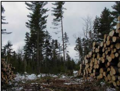
Harvest operation at Richardson Lakes

Bureau staff closely supervises each harvest by marking individual trees for removal or by providing loggers with strict harvesting criteria. These criteria specify which trees are to be harvested. All harvest operations are inspected by Bureau staff on a weekly basis; more often when individual situations warrant.