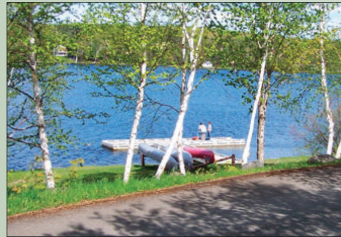
Floating dock and rental canoes available.