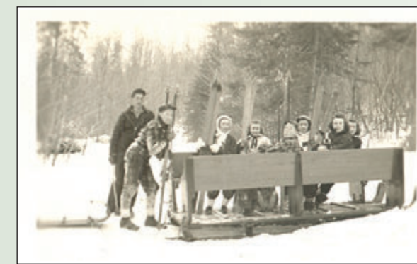
Ski sled circa 1939; file photo.