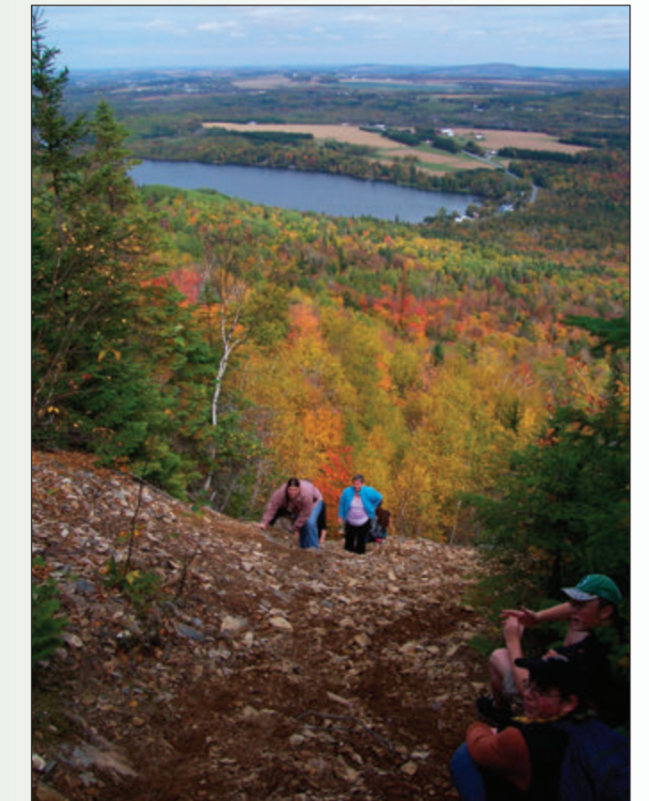
View from South Peak Trail.

Large brook trout can be found in spring-fed Echo Lake.