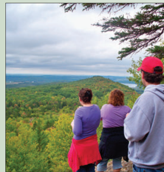
View from South Peak