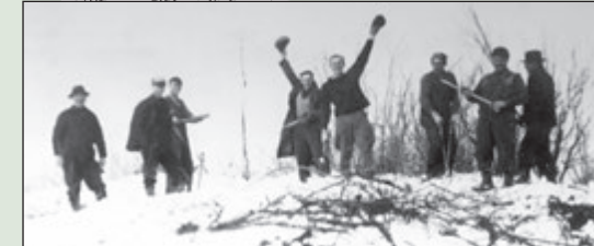
Ski trail workers circa 1938; file photo.