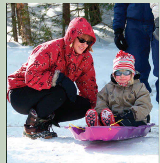
Winter fun at Arroostook State Park.