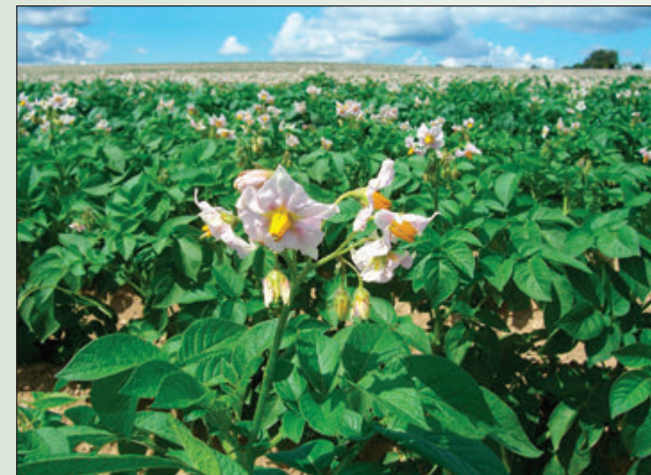
Potato crop in bloom.