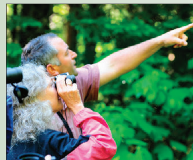
Birders at Arroostook State Park.

This brochure was made possible in part by funding assistance through the Federal Highway Administration's Recreational Trails Program (RTP), administered by the Maine Bureau of Parks and Lands.