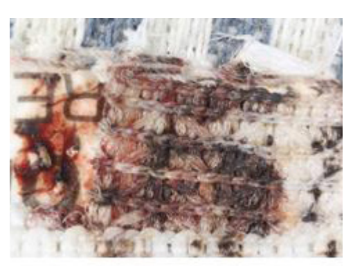
Blood droplet immediately after feeding