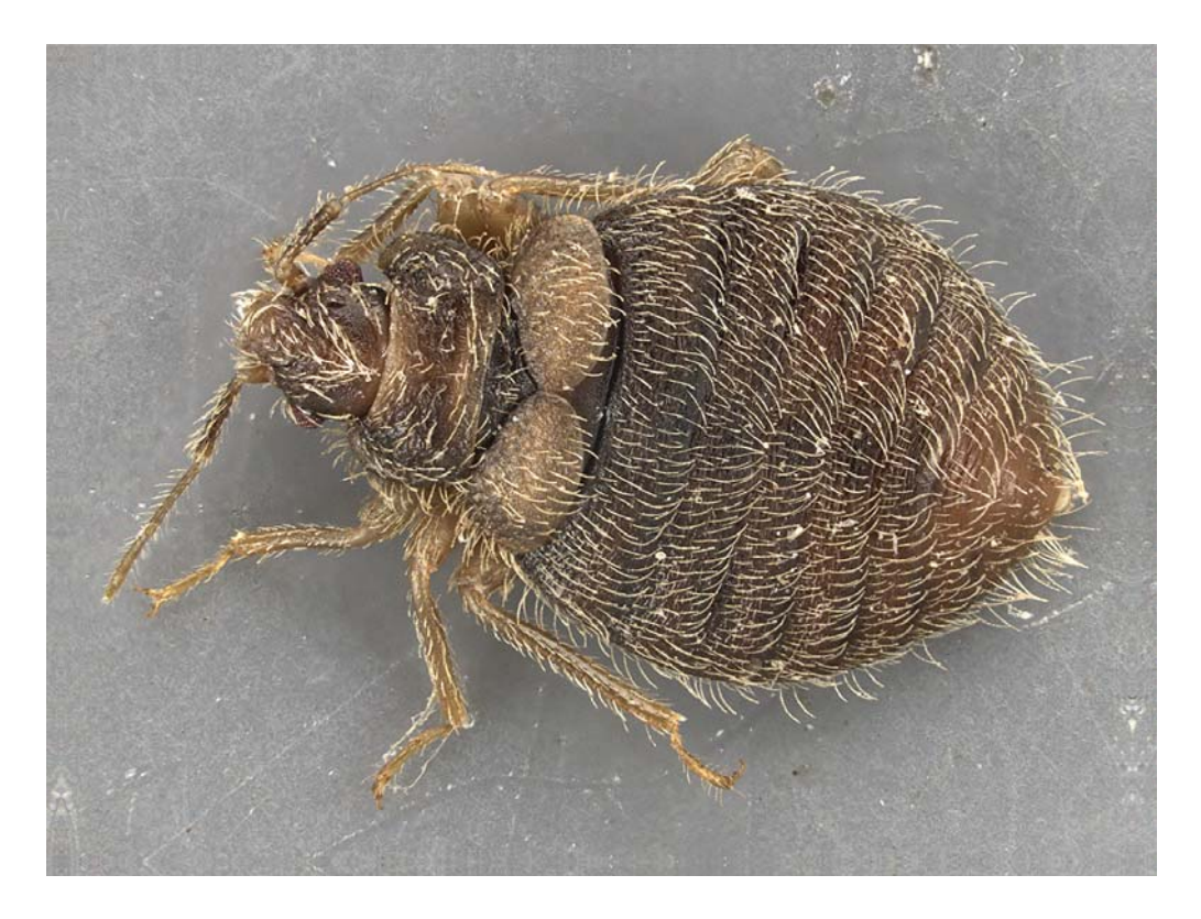
Swallow bug Oeciacus vicarius is a parasite of barn and cliff swallows

It is important to identify the type of bed bug because due to their different habits, proper identification determines where to direct control measures. For example, bat bugs ( Cimex pilosellus ) look similar to human bed bugs but control efforts must include elimination of bats from a structure to be effective.