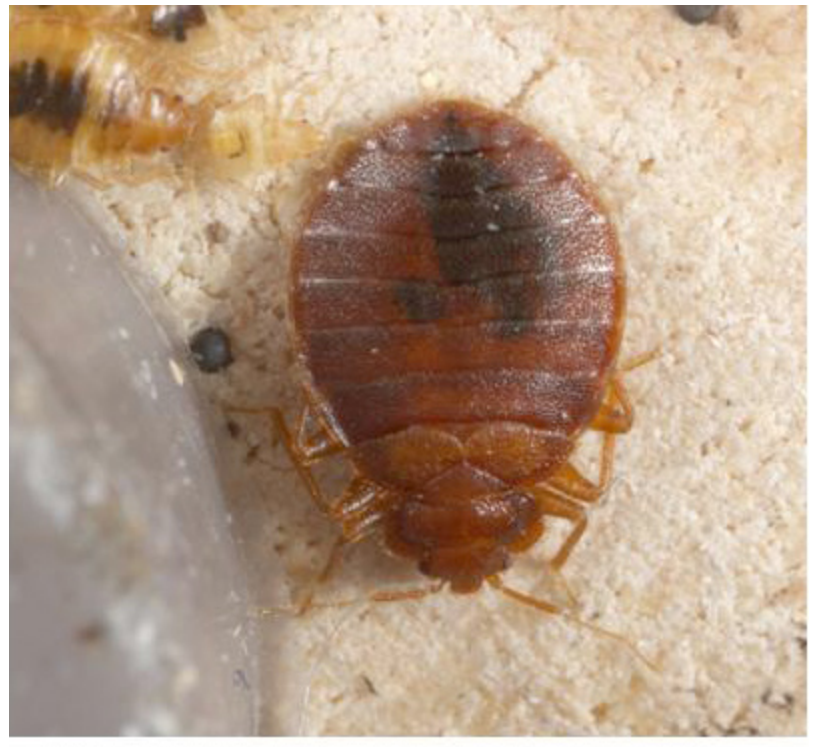
Bed bugs resting under a stuffed chair. Bed bug adult in center, 1st instar nymph and older nymph in upper left.

Bed bugs are active at night when they leave their daytime resting place deep inside cracks and crevices to seek out human blood. If bed bugs are seen during the day, it usually means that their hiding location has been disturbed, they have contacted a pesticide, or else they are very hungry and are desperately seeking a blood meal. Adult male and female bed bugs, as well as nymphs (young), feed on blood. By checking the bed linen in the middle of the night you have the best opportunity to find bed bugs on the move. Any nearby crack or crevice can serve as a daytime refuge for bed bugs. Look for bed bugs under folds in mattresses, along seams and in between bedposts and bed slats. Bed bugs are frequently found in easy chairs, sofas and other furniture used as sleeping locations. Other places to look for bed bugs during the day include behind baseboards, in night stands, inside pillow cases, along the edge of curtains and inside any piece of furniture that is located adjacent to the bed. When large numbers of bed bugs are present, they produce a distinctive pungent odor. Numerous dark fecal spots on linen or near cracks are another indication of a bed bug infestation. If only one or two bed bugs are found, it is difficult to estimate how many other bed bugs are in hiding. Large infestations of bed bugs have a tendency to disperse to other locations in the building, especially if the host person vacates their room for a period of time.