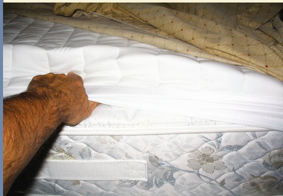
checking mattress for bed bugs

Bed bug service often involves the use of insecticides, which have been demonstrated to be effective and safe treatment options when used correctly by trained personnel. The BMPs offer valuable reminders on essential health and safety considerations.