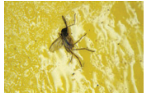
Figure 3: Fungus gnat on sticky card.

The most important strategy to minimize fungus gnat problems associated with houseplants is to allow the growing medium to dry between watering, especially the top 1 to 2 inches. The dry-growing medium will decrease survival of any eggs laid and/or larvae that hatch from the eggs as well as reduce the attractiveness of the growing medium to egg-laying adult females. In addition, it is recommended to re-pot every so often, particularly when the growing medium has “broken down” and is retaining too much moisture. Furthermore, be sure to remove any containers with an abundance of decaying plant matter such as decayed bulbs and roots, which provide an excellent food source for fungus gnat larvae.