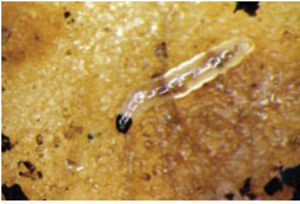
Figure 4: Fungus gnat larvae on potato slice.

The larvae in the growing medium will not be directly affected by any insecticides applied to kill adults. An alternative approach to deal with fungus gnat adults, particularly when populations are abundant, is to strategically place yellow sticky cards (sold as Gnat Stix) underneath the plant canopy or on the edge of containers. The adults are attracted to yellow and will be captured on the sticky cards. This may be helpful in mass-trapping adult females, thus reducing the number of larvae in the next generation.