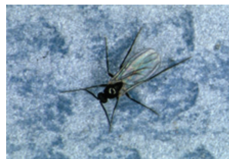
Figure 1: Fungus gnat adult.

Adults are 1/8 inch long, delicate, black flies with long legs and antennae. There is a distinct “Y-shaped” pattern on the forewings. The larvae are worm-like and translucent, with a black head capsule, and live in the growing medium of houseplants.