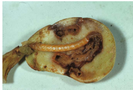
Wireworm and damage to lima bean.