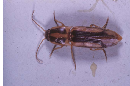
Adult Conoderus wireworm.