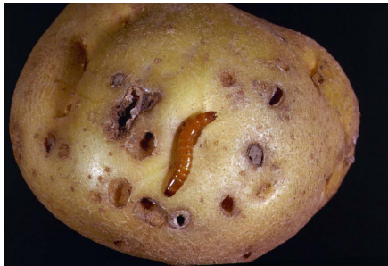
Wireworm and damage to potato.