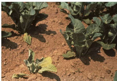
Damage to cauliflower (root damage).