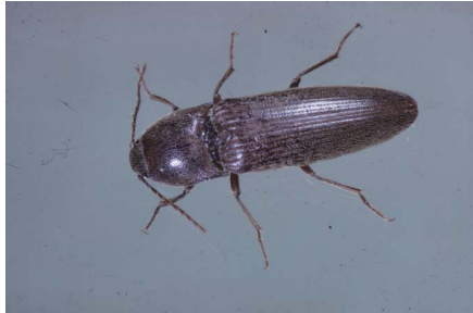
Adult Melanotus wireworm.