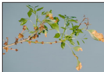
Figure 2. Terminal dieback and partly killed Modesto ash leaves due to ash anthracnose.