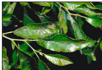
Figure 1. Black leaf spots caused by Chinese elm anthracnose.

With careful management, some cultivars of susceptible landscape plants can be grown at a high level of aesthetic quality, despite the presence of