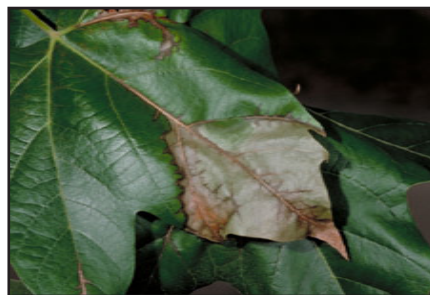
Figure 3. Anthracnose symptoms on a sycamore leaf.

anthracnose. For new plantings, choose varieties that are resistant to these fungi. Space the plants far enough apart to maximize air circulation and increase sunlight, both of which facilitate faster drying of leaf surfaces when trees are fully grown.