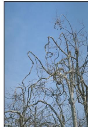
Figure 4. Sycamore limbs distorted by anthracnose infection.

While pollarding—severe pruning that removes all of the previous year's growth—isn't recommended for most trees, you can use this method on London plane trees to control anthracnose, because it removes pathogen-infected shoots. However, pollarding increases susceptibility of London plane trees to