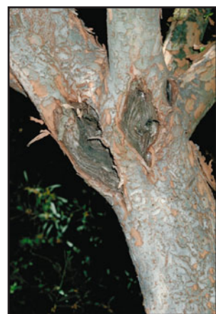
Figure 5. Chinese elm anthracnose cankers.