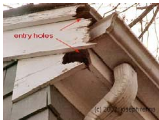
Squirrel damage on house

Dealing with Squirrels Indoors – A squirrel's most damaging activity is gnawing an entrance hole into attics, nesting, damaging insulation, and occasionally chewing on wires creating fire hazards. Squirrels are good climbers and can enter homes by chewing under eaves, entering through natural openings like uncapped chimneys, or gaining entrance if tree limbs overlap the roof line. Prevent squirrel damage by trimming branches eight to ten feet from buildings to limit access to roofs and remove food sources outdoors. Screen openings such as attic louvers, vents, and fans with ¼ inch mesh hardware cloth. Close eaves tightly, replace rotten boards, and cap chimneys.