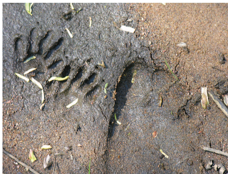
Raccoon and human tracks.

During the daytime, raccoons rest in ground beds which are often located on high places in swamps or marshes or in agricultural fields. They may also use hollow trees, rock crevices, burrows, caves and buildings. Squirrel leaf nests or large, abandoned bird nests are favorite resting places during spring and autumn. The distances between daily resting sites may be as great as one mile; the same site is seldom used for two consecutive days.