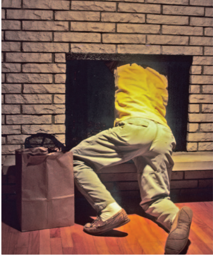
After visually inspecting the chimney to make sure it is clear, install a chimney cap to keep raccoons and other pests out.