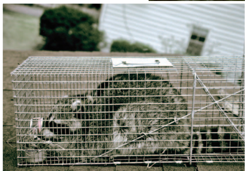
A live-trapped raccoon is removed to be relocated at least 10 miles away.

A captured raccoon should be relocated at least 10 miles from where it was caught. Before releasing a raccoon on private land, you are required to obtain the permission of the landowner; a WDNR permit is necessary before a release on public lands. Be extremely careful when handling a raccoon in a live trap. The animals can snap quickly, bite hard and may carry one of several diseases that can be transmitted to humans. In some cities, small businesses specialize in the removal of nuisance animals and will handle the raccoon problem for you at a reasonable fee. Referral lists are available from USDA-Wildlife Services offices, or you can check under “Pest Control” or “wildlife” in the business listings of your local phone book.