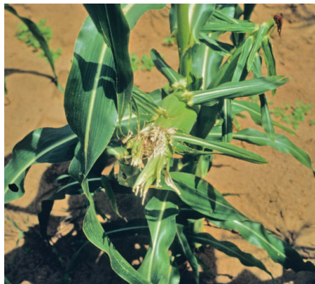
Corn damaged by a raccoon.

In large commercial corn fields, the only source of relief from damage may be to reduce the