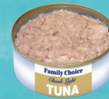
Light Canned Tuna