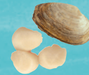
Clams and Scallops