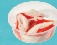
Imitation Crab and Lobster