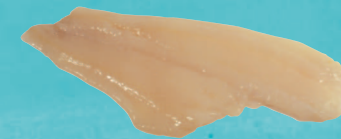
Flounder and Sole