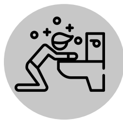
Nausea and Vomiting