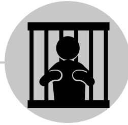
People Who Are or Were Incarcerated