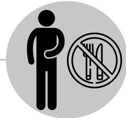
Loss of Appetite