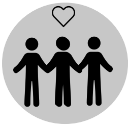
People Who Have Multiple Sex Partners