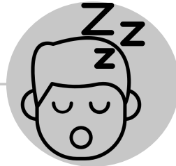
Feeling Very Tired