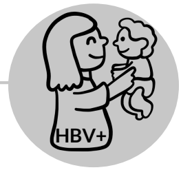
People Who Were Born to a Mother with Hepatitis B Virus

Other risk factors include men who have sex with men, having a sexually transmitted disease, living with a person with chronic hepatitis B, sharing tattooing equipment, being on dialysis, and sharing personal care items or medical equipment.