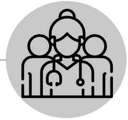
People Who May Be Exposed to Blood at Work