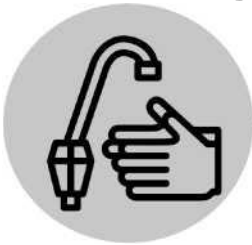
Dhaq Gacmahaaga Had iyo Jeer