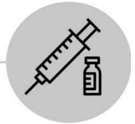
Qaado Tallaal (Tallaalka DTaP ee carruurta, Tallaalka Tdap dadka ee waaweyn)