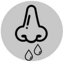
San duuf leh