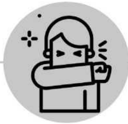
Ku Dabool Qufaca Xusulkaaga