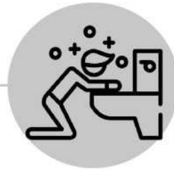
Matag ama gariir qufac kadib