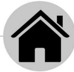
Guriga Joog Markaad Xanuunsato