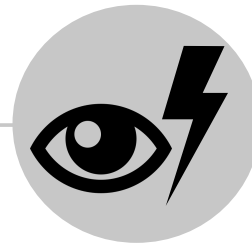
Conjunctivitis (Red Eyes)