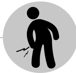
Joint and Muscle Pain