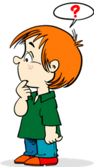
Time to Think