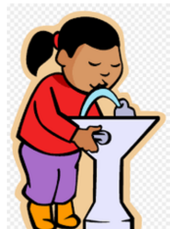
Drink of Water