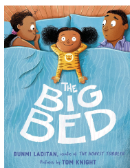
The Big Bed by Bunmi Laditan