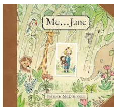
Me... Jane by Patrick McDonnell

The Big Bed helps us understand how to make a strong argument. Go to the library or look on your bookshelf at home to find more books where one character tries to convince another character about something or to do something.