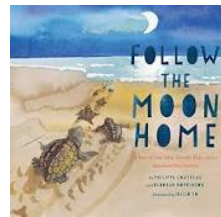
Follow the Moon Home by Philippe Cousteau and Deborah Hopkinson

Our final book of the year is a story about how children and their teacher started a project to convince people in their community to help sea turtles using light. What connections can you make to other things we have learned about this year?