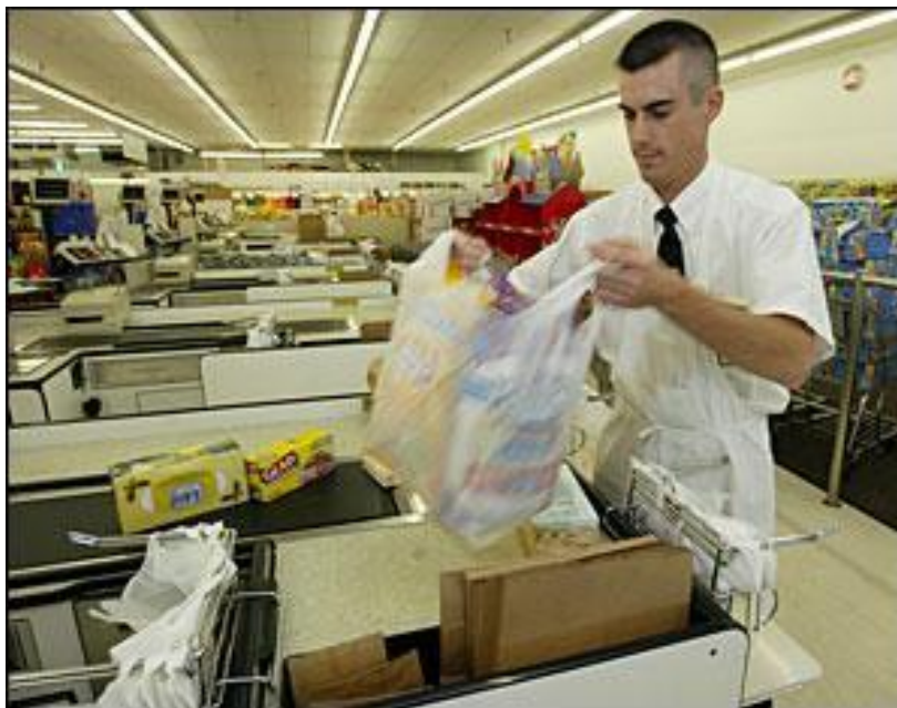
A bagger puts the groceries, purchased by customers, in a bag