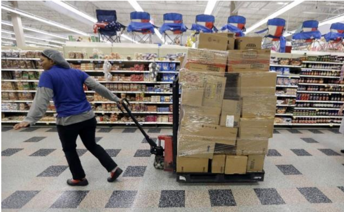
A stocker puts groceries on the shelves.