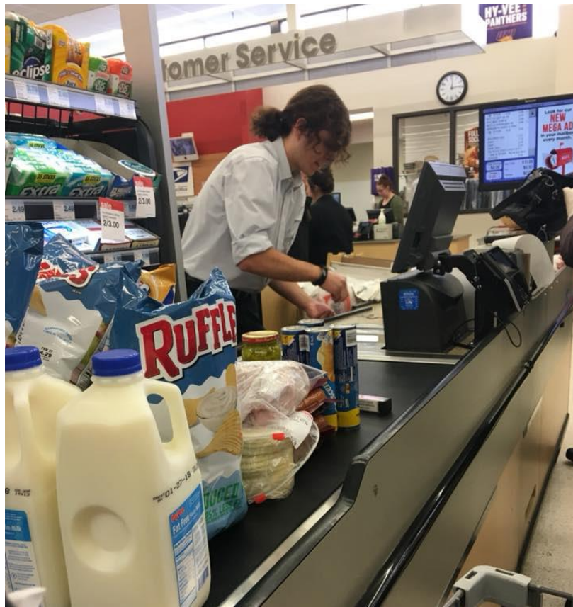
A cashier scans groceries and collects money from shoppers.