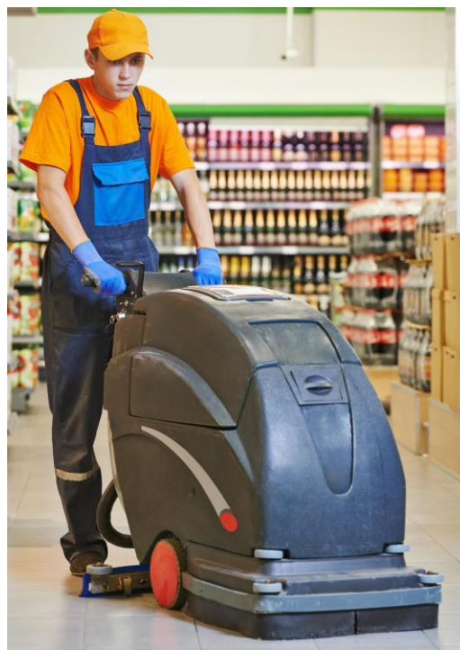
Another job is to clean the floors.