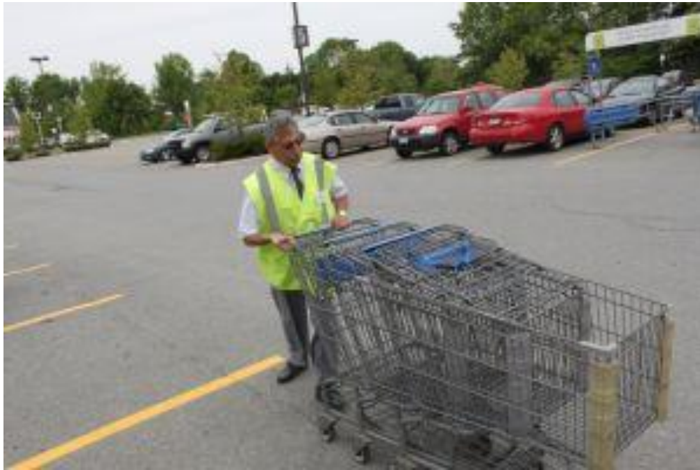
One job is to return shopping carts from the parking lot to the store.