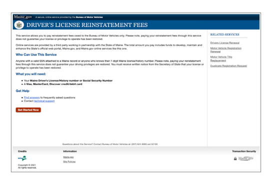
Driver's License Reinstatement Fees